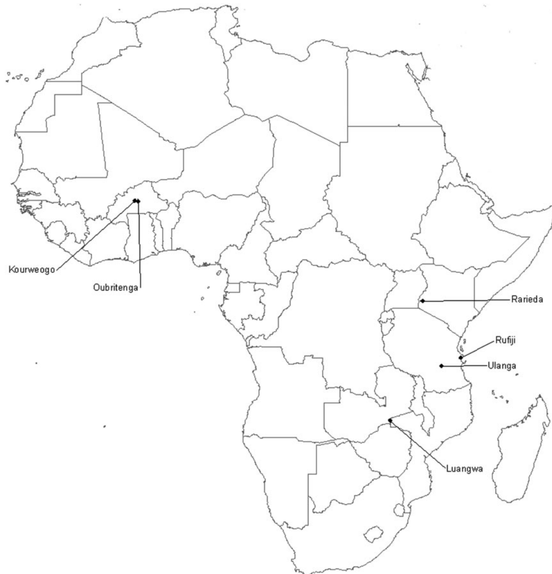
Figure 1 Map of Africa showing locations of study sites

observations were recorded by a field worker who sat in a randomly selected compound and recorded the number of people who were awake at hourly intervals from 6.00 pm until all of them retired indoors. A similar procedure was used in the same compound from 4.00 am to 6.00 am on the following morning. In the MTC study, four questions were incorporated into standard cross-sectional malaria indicator survey questionnaires asking when, to the nearest hour, the respondent went indoors for the night, went to bed to sleep, awoke in the morning, and left the house in the morning.