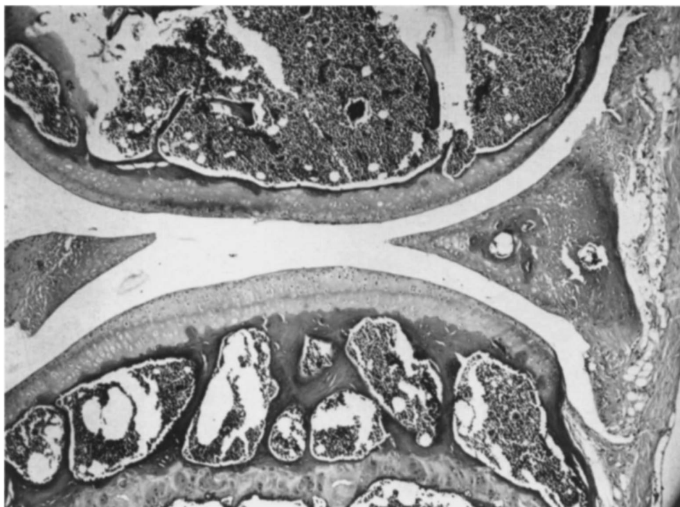
Fig. 1. Unchanged knee joint showing intact surfaces of femur (top), tibia (bottom), and menisci (middle right and left). x70.