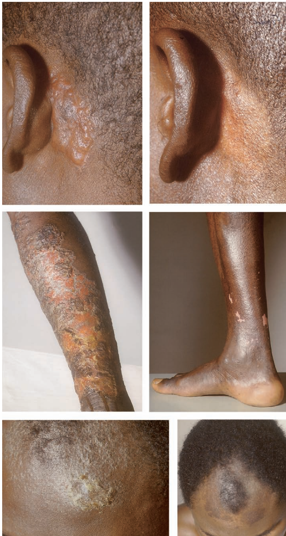
Figure 1. Retroauricular region, right leg, and forehead of the patient before ( left panels ) and after ( right panels ) receiving miltefosine therapy (50 mg twice daily for 3 months).