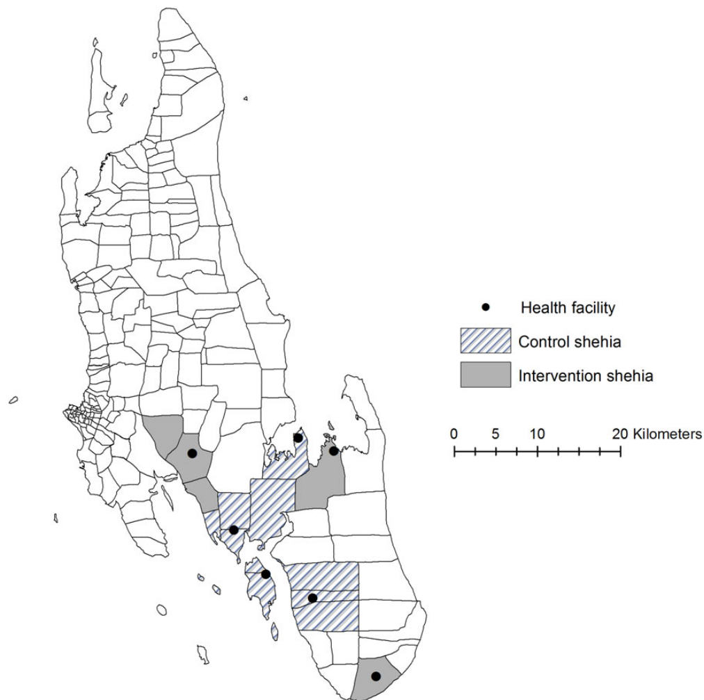
Figure 1. Map of control (striped) and intervention (grey) study shehias and health facilities (black dot), Unguja Island, Zanzibar.

DNA extraction is approximately 1–2 parasites/ \mu\text{L} blood for Plasmodium species (Xu et al, unpublished data, 2014). Restriction fragment–length polymorphism analysis and sequencing of the cytb qPCR product was used for species determination.