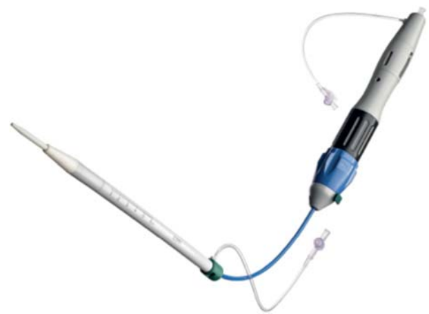
Figure 2: Redesigned flexible prosthesis delivery system with soft tip: loaded device before implantation.

The procedures were performed from September 2010 to July 2011. All procedures were performed in a surgical hybrid suite and with cardiopulmonary bypass on stand-by. The delivery system is composed of a 29Fr (inner diameter) introducer and a flexible delivery catheter with a 13Fr shaft, which form one integral unit (Fig. 2). Prior to the procedure, the valve was crimped and mounted onto the delivery system and handed pre-flashed to the operator. A temporary trans-venous pacemaker wire was inserted for rapid pacing. A 6Fr femoral arterial sheath was inserted into one femoral artery and a pigtail catheter was placed into the aortic root for contrast aortography. A 6F introducer sheath was inserted into one femoral vein and a guidewire placed in the right atrium to establish access for fast cannulation in case conversion to extracorporeal circulation became necessary (safety precaution). Low-dose heparin was given with a target activated clotting time of 250 s.