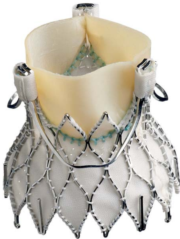
Figure 1: Engager™ valve prosthesis.

used: polyester and expanded polytetrafluoroethylene. For this study, the bioprosthesis was available in two sizes, labelled as 23 and 26 according to the diameter at the commissural outlet (in mm); the Engager 23 and 26 have a total deployed frame length of 25.5, and 27.5 mm, respectively. These two sizes are designed to fit an effective aortic annulus diameter by computed tomography (CT) between 21 and 26.5 mm, typically corresponding to an echocardiographic annulus diameter between 19 and 26. The valve is sterilized and stored in a glutaraldehyde solution. To achieve an anatomically correct position, a defined height of implantation and to minimize the risk of coronary obstruction, the side arms fixed at the main frame of the prosthesis are designed to be placed into the sinuses of the aortic root.