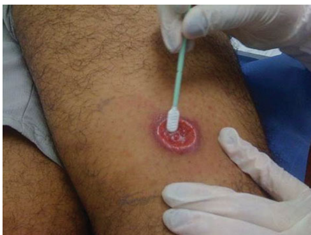
Fig. 2. Specimen collection by swab sampling of a cutaneous ulcer of a patient with suspected CL.

swab and 1 aspirate sample. Isohelix DNA Isolation Kit (Cell Projects™, Kent, UK) was used to extract DNA from the second swab. A crude 'Boil-Spin' method was used for the second aspirate sample. Swab and aspirate replicate samples from each patient were randomly selected for different extraction methodologies. Extractions using Qiagen and Isohelix kits were performed according to manufacturers' protocols and resultant DNA eluted in 50 \mu\text{L} distilled water. Boil-Spin was processed using a protocol adapted from http://www.finddiagnostics.org/export/sites/default/programs/hat-ond/docs/SOP_RIME_LAMP_kit_template_23MAR12_final.pdf ; 40 \mu\text{L} plasma (bovine) plus 60 \mu\text{L} distilled water was added to 100 \mu\text{L} of the aspirate sample and incubated at 90 °C for 10 min. The sample was centrifuged for 3 min at 14 000 rpm to eliminate any debris. Two