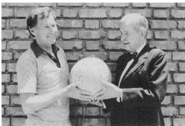
FIG. 2. Two World Campaign for The Biosphere leaders symbolically supporting 'the globe' in Srinagar, India, June 1984. The modern brick wall is also symbolic: when a situation is allowed to deteriorate to the extent that it becomes biospherical, people are virtually backed against a wall. So why the smiles? Because the Campaign is in action, and people in more and more regions and walks of life are talking about The Biosphere and relating their lives to it as the sole life-support.

is left to Nature's ways of shortage and deprivation, famine and/or pestilence, and to Mankind's own way of increasing violence and slaughter. Yet, this ever-worsening situation has to be remedied if our World is not to deteriorate further and further into a plethora of dreary monocultures and widespread squalor. Of the need for proper remedy, environmental education and due awareness should at least provide an overview warning, while pointing the way widely to stewardly care and ultimate amelioration—hence the new WCB-ISEE dual establishment to carry on the World Campaign for The Biosphere as explained by Davis (1983).