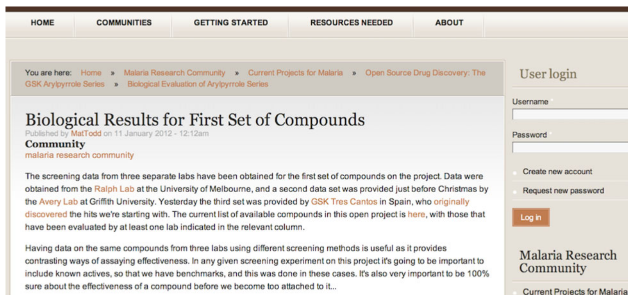
Fig. 4. The Synaptic Leap, a coordination site allowing project discussion and updates.

in this way has a democratising or levelling effect that undercuts the traditional academic monikers—thus for example in comments under a post in the malaria project (Fig. 4) ( http://www.thesynapticleap.org/node/367 ) an undergraduate student and a professor who had never met were able to discuss openly a point of theory about the data without it ever mattering who was who.