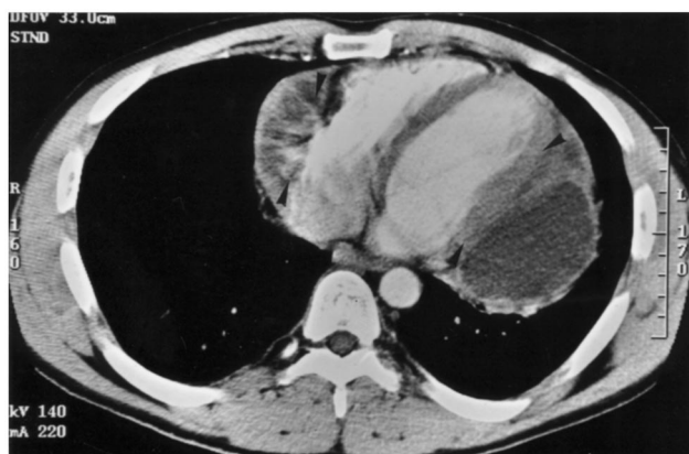
Fig. 1. CT showed multiple masses adherent to the pericardium leading to severe compression of the left and right ventricle (arrow heads).

fic 12-base pairs PCR product was detected by agarose gel electrophoresis (Fig. 2). In comparison results were compatible with tuberculosis.