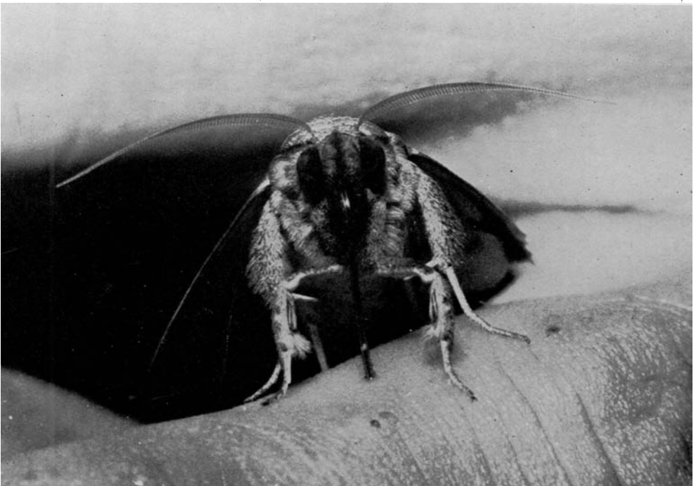
FIG. 2. C. eustrigata piercing the skin. Part of the saw-tooth armature of the proboscis still visible.