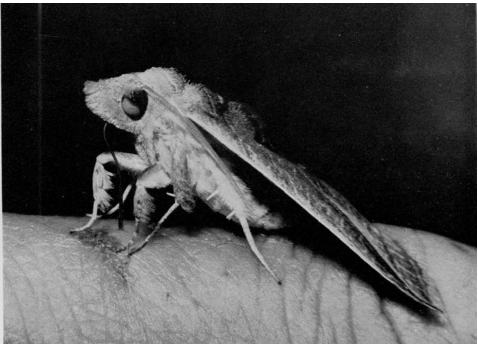
FIG. 2. C. eustrigata , with abdomen distended, about to finish sucking, as indicated by the laying of the antennae against the body.