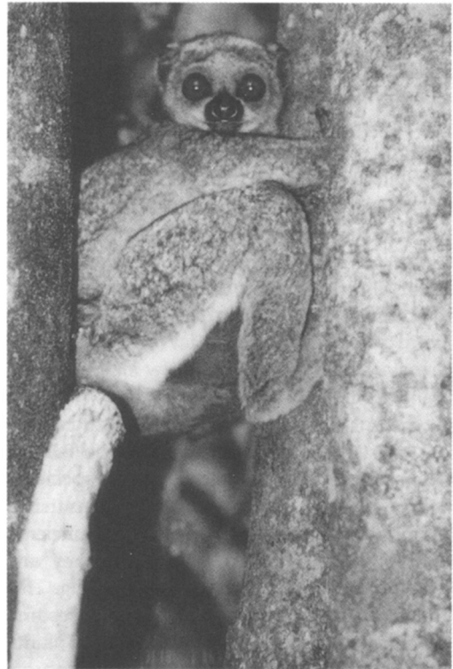
A male woolly lemur ( Avahi cf. occidentalis ) from Bemaraha at a sleeping site during the day (Thomas Mutschler).

Propithecus v. deckeni . In addition to the well-