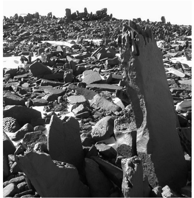
Fig. 4. Antarctic tors or “gargoyles” on Mount Bowen. The column in the picture is approximately 1 m high (note hammer on top of the column).

to a strong underestimation of the surface exposure age (see discussion section).