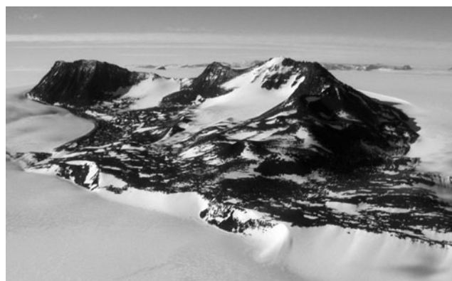
Fig. 2. Ford Peak, view from the north-east. General ice flow direction is from the back to the front of the photograph. The ice level drops by roughly 300 m from the stoss side to the lee side of the nunatak.

In addition to the “gargoyles”, we sampled a small bench 50 m below the oldest trimline, at 1700 m a.s.l. Flat dolerite