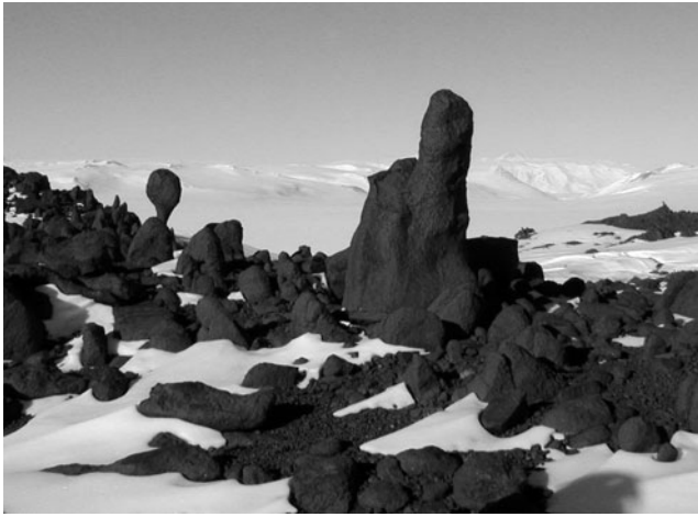
Fig. 3. Antarctic tors or “gargoyles” on Chisholm Hills. These tors are smaller than those on Mount Bowen, reaching heights of about 50 cm.

tables of more than one square metre are covered with the same stain coat and desert varnish, but glacial striae are preserved as well. These striae indicate ice flow in north-easterly direction towards David Glacier. This is consistent with the flow pattern observed on nearby Ricker Hills.