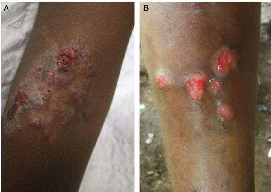
Fig. 3 Skin lesions of secondary yaws. A , Crusted maculopapular lesion of secondary yaws. B , Multiple ulcers of secondary yaws (Images reproduced with permission of M.M. and O.M.).