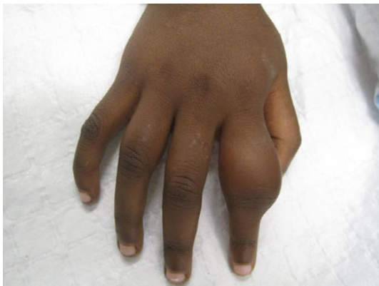
Fig. 4 Bony lesions of secondary yaws. Dactylitis due to secondary yaws (Images reproduced with permission of O.M.).

ulceration. Goundou , which was rarely reported even when yaws was hyperendemic, is characterized by exostoses of the maxillary bones. 2