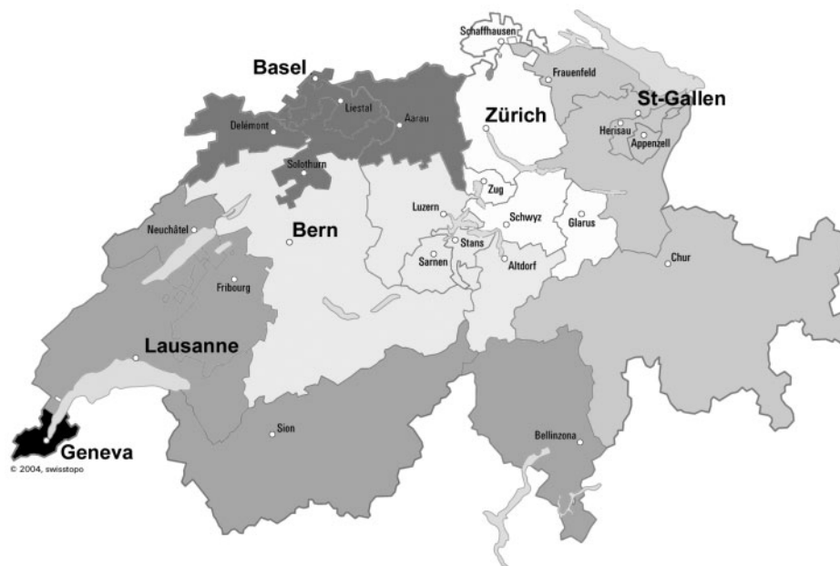
Figure 1 Location of the six major centres of inclusion and their working areas