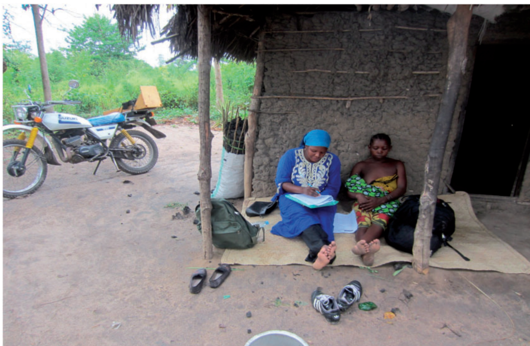
Figure 3. An update round interview underway in a household, by a trained fieldworker within the Rufiji HDSS.

In 2012 the population size of the DSA was about 103 503 people, residing in 19 315 households. The population structure, age and sex composition of the area is presented in Figure 4. There are several ethnic groups in the DSA. The largest is the Ndengereko; other groups include the Matumbi, Nyagatwa, Ngindo, Pogoro and Makonde. The population comprises mainly Muslims with few Christians and followers of traditional religions. The main language spoken is Kiswahili. English is not commonly used in the area. Around 75% of the population aged 7–15