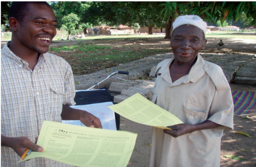
Figure 5. Rufiji HDSS field interviewer provides a news letter to the Rufiji HDSS member, as one of the feedback mechanisms.