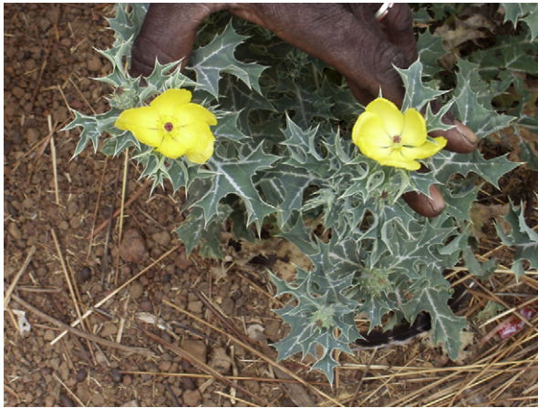
Figure 1. Argemone mexicana L. (Papaveraceae).

lead to the very widespread use of ACTs, and a greatly increased risk of resistance.