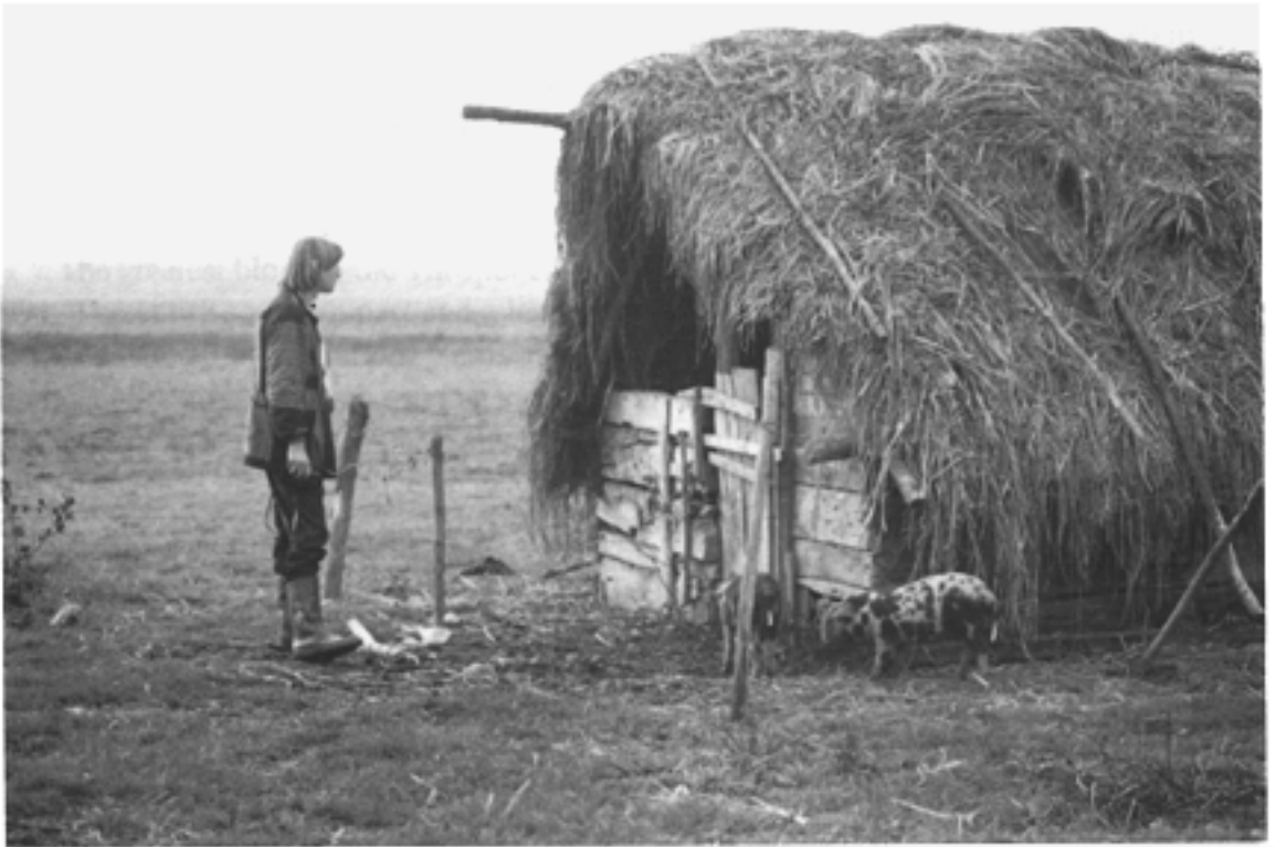
Pigstie in Sava meadows