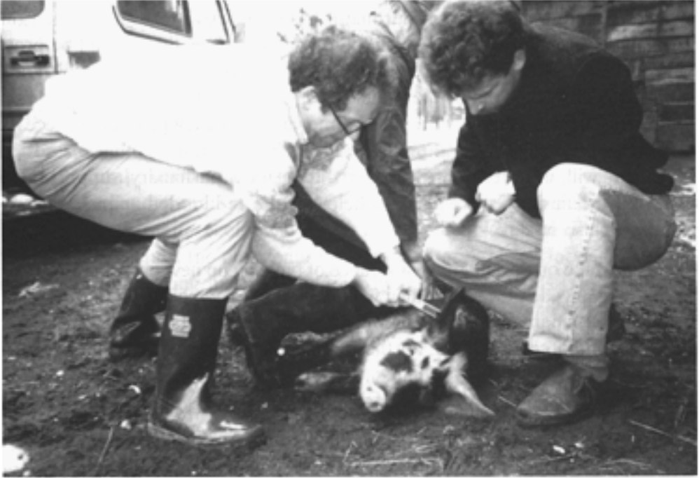
Transport of pig at the Zagreb Zoo