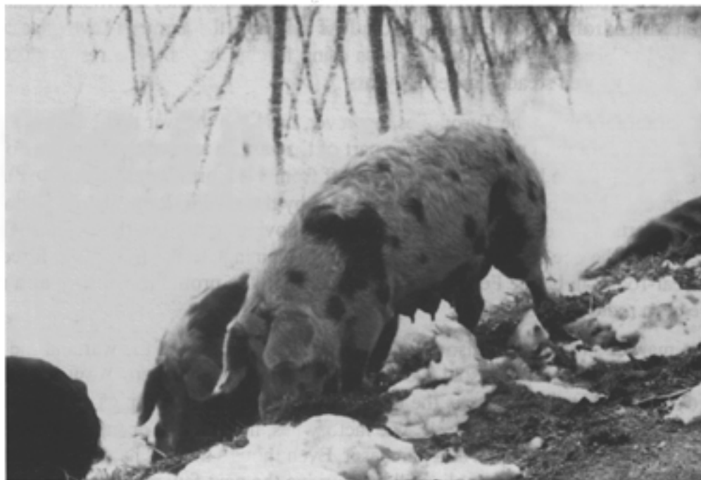
Sows in winter