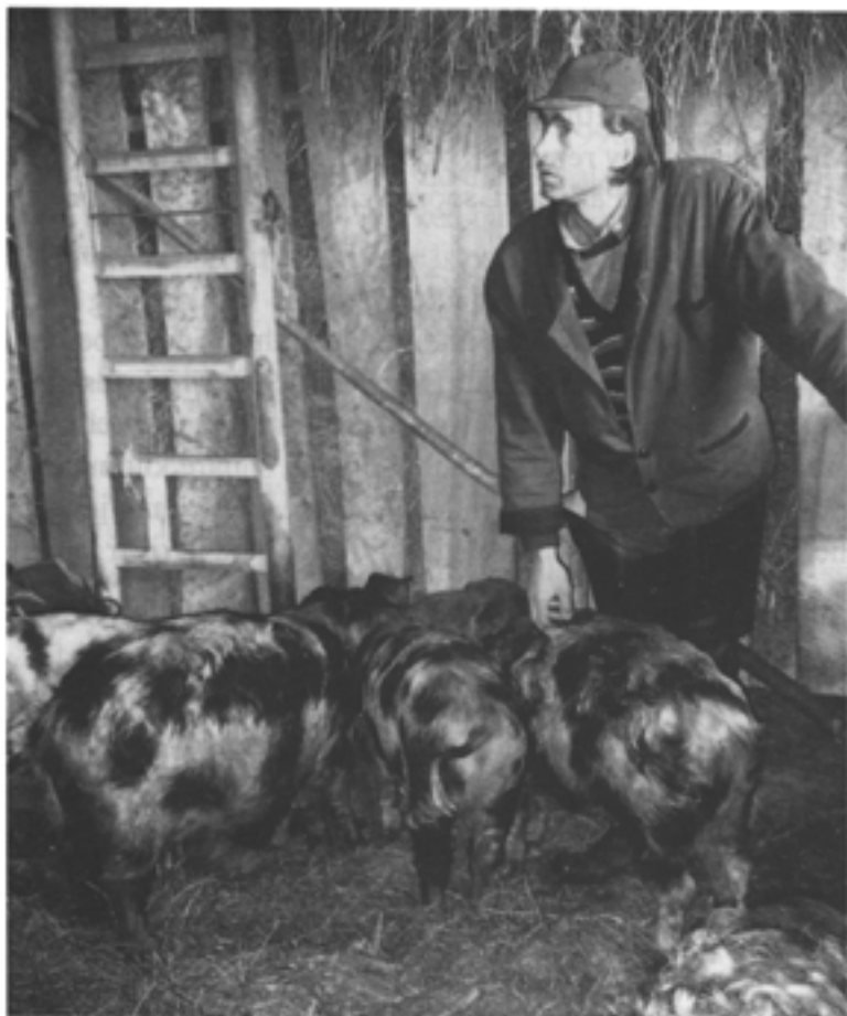
Breeding group at Kratecko