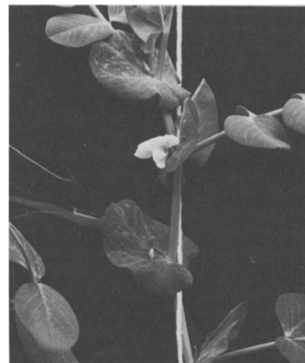
Fig. 2. Portion of plant cultivated under natural short days in greenhouse showing G2-type response. Abortive flowers appear above and below normal flower.

From a cross between the G- and the I-lines we have recovered still another