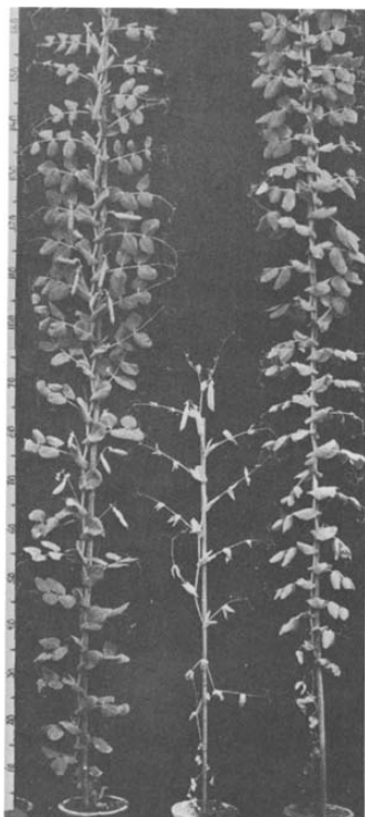
Fig. 3. Three photo-dependent response types in peas. Left (G 2 -type): reproductive phase is initiated early, but apical growth continues despite irregular production of fruits and seeds. Note presence of flowers at apex and fully mature fruits near base. Center (K-type): flower initiation is delayed but, once begun, normal reproductive activities lead to rapid senescence and plant death. Right (G-type): flowering is inhibited; plant remains vegetative. All plants grown under short day conditions.

trating the effects of the genotype and the environment upon senescence the results of only one cross are presented here.