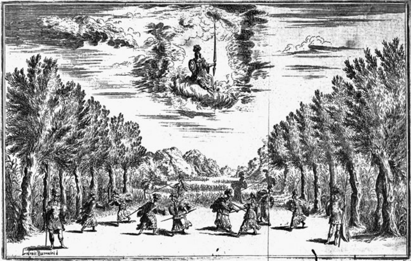
Figure 3 Francesco Sbarra and Antonio Cesti, Il pomo d'oro , II. 13–14; engraving by Lodovico Ottavio Burnacini

that the young women perform on Pallas's birthday, as is the custom 88 – in which he alludes to the sovereign's birthday by identifying her with the Greek goddess of war, depicted in the engraving as the arbiter, in macchina , of the bout.