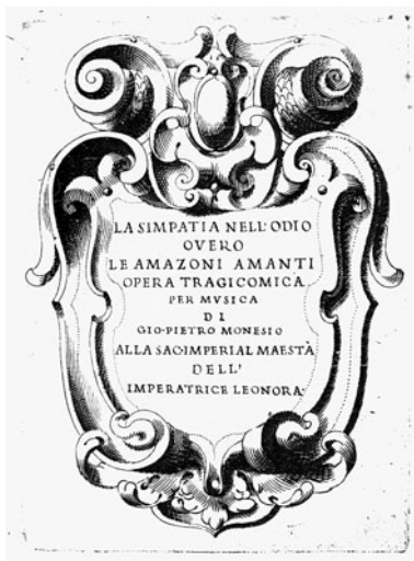
Figure 1 Giovanni Pietro Monesio, La simpatia nell'odio, ovvero Le amazoni amanti , Cod. 9956, title page, fol. [2 r ]

Eleonora II Gonzaga-Nevers was signed in Rome by the author himself, on the 1st of August, 1664; therefore the libretto, of which the title page is shown in Figure 1 and the list of characters in Figure 2, could have arrived in Vienna in August, or September at the latest.