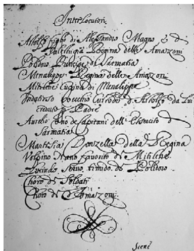
Figure 2 Giovanni Pietro Monesio, La simpatia nell'odio, ovvero Le amazzoni amanti , Cod. 9956, cast, fol. 3 v

is mentioned in a avviso sent to Florence a few days later. 10 A reference to the birthday of 1664, however, appears in the score of a one-act composition by Antonio Bertali, Pazzo amor : ‘Operetta per la nascita dell’imperatrice Eleonora, 1664’. 11 Therefore, according to Seifert, there are two possible hypotheses: either the author of the avviso named the wrong composer, though it is highly unlikely he would confuse His Majesty with a common composer, or two separate works were written for the event, only one of which was performed. 12