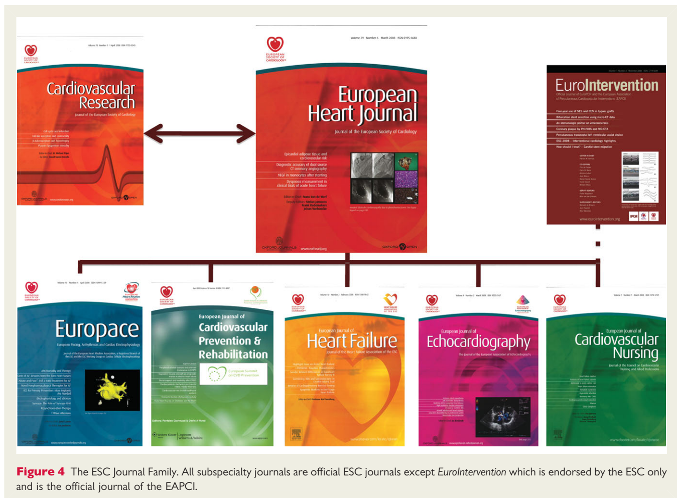
Figure 4 The ESC Journal Family. All subspecialty journals are official ESC journals except EuroIntervention which is endorsed by the ESC only and is the official journal of the EAPCI.

The ESC Journal Family is well positioned to respond to a changing world. In fact, many subspecialty journals already exist within the ESC Journal Family (see above; Figure 4 ) and—in contrast to those published by the American Heart Association and the American College of Cardiology—most of them already have formidable impact factors. It is with great pleasure, therefore, that we are able to announce that all editors of the ESC Journal Family will join the new Editorial Board of the European Heart Journal as Associate Editors. As of January 2009, therefore, the Editors of the European Heart Journal will be closely linked with Karl Swedberg, Editor of European Journal of Heart Failure , Michael Piper, Editor of Cardiovascular Research , Jos Roelandt, Editor of the European Journal of Echocardiography , John Camm, Editor of EUROPACE , Pantaleo Gianuzzi and Diederick E. Grobee, new Editors of the Journal on Cardiovascular Prevention and Rehabilitation , and Tiny Jaarsma, Editor of the European Journal of Cardiovascular Nursing . Manuscripts that will appear more suitable for a ESC subspecialty journal will be