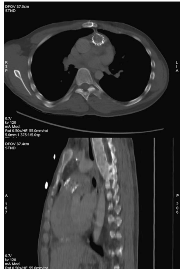
Fig. 2. A control computer tomography scan showing the implanted stent-valve (Sapien® valve, Edwards, Irvine, CA, USA) in the stenotic pulmonary conduit.

Surgery for right ventricular outflow tract reconstruction is necessary in case of pulmonary atresia and Tetralogy of Fallot, common arterial trunk and Rastelli operation in great vessels transposition and ventricular septal defect with pulmonary stenosis. However, although the survival of