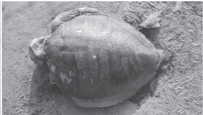
olive ridley turtles washed ashore on A. Odaikuppam and B. Kanathur Reddykuppam beaches