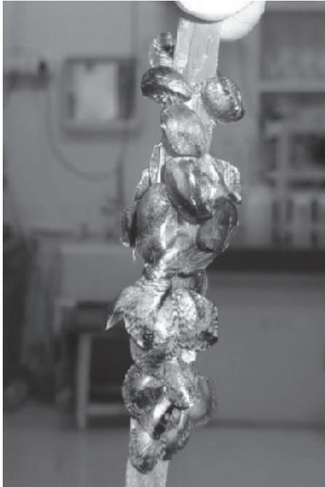
Fig. 2. Electroma vexillum attached on seagrass leaf blade from 0.84 - 2.51mm ( 1.38 \pm 0.20 mm) were found attached to the seagrass species with narrow leaf blades like Syringodium isoetifolium . This zonation

in distribution proved the ability of this species to utilize seagrass leaves as settlement surface selectively as the growth advances. 68.9% of the total biomass of Halophila ovalis beds and 72.6% of Cymodocea serrulata beds were constituted by this bivalve, which indicated gregarious nature of this species.