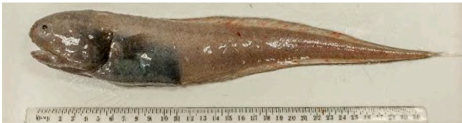
The fish samples of the Ophiidid Bassozetus sp.