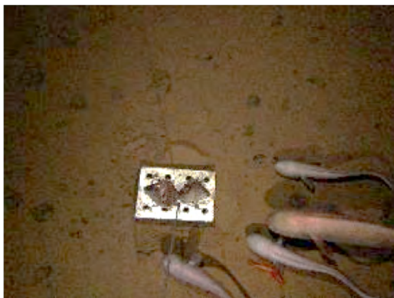
A still image showing the cusk eels in situ .