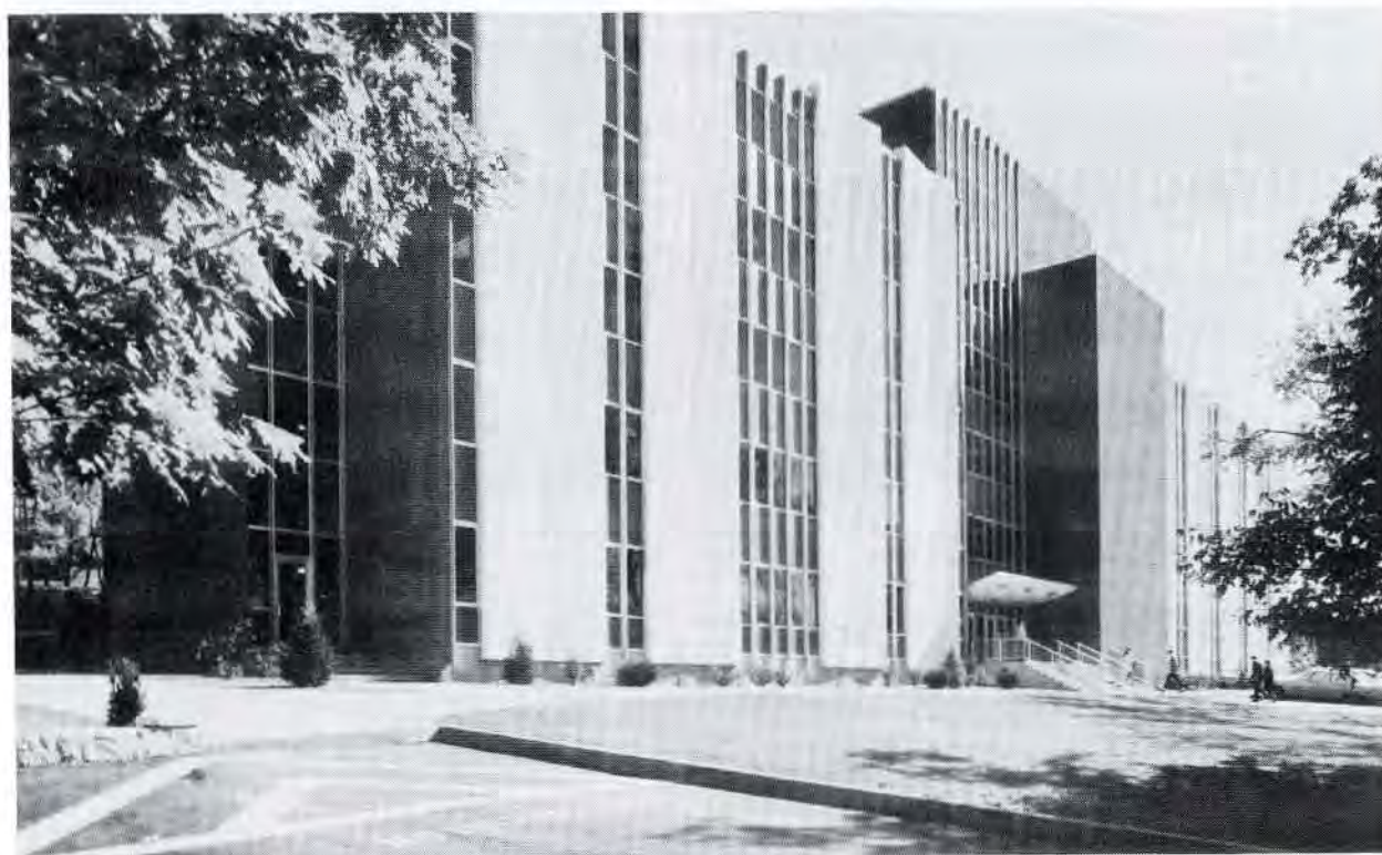
FINLEY C. GRISE HALL