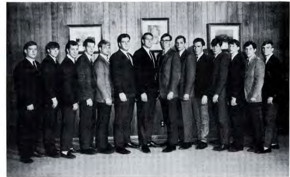
PLEDGE CLASS.....Left to right -