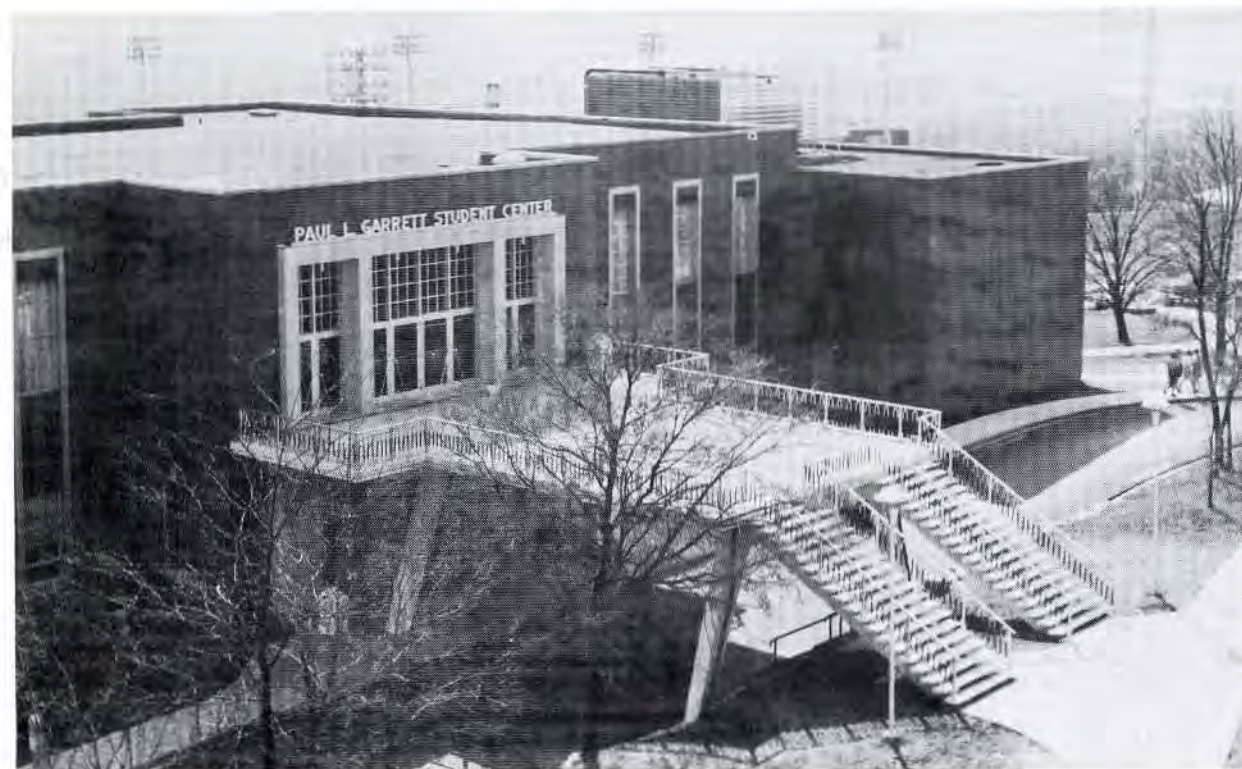
PAUL L. GARRETT STUDENT CENTER