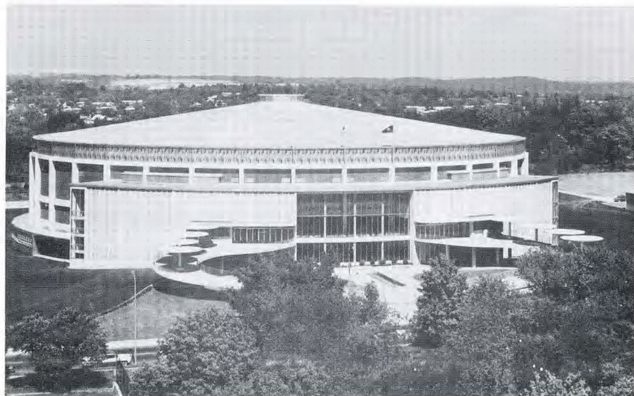
E. A. DIDDLE ARENA