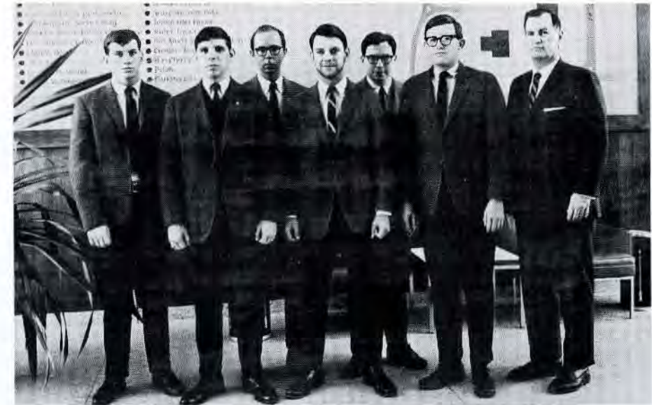
OFFICERS.....Left to right -