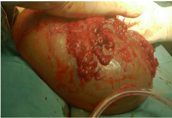
Figure 1. Gestational sac with the fetus.

After vital sign stability and fixing 2 IV lines and reserving packed cell for transfusion, patient transferred to operation room. An emergency laparotomy was performed immediately with simultaneous ongoing resuscitation. Intraoperative findings revealed about 1000 ml blood in abdominal cavity and between of intestinal loops. Uterus was torn in corneal zone and huge part of gestational sac with fetus and amniotic fluid moved away from tearing zone. Rupture was in uterus fundal and cornea in previous myomectomy scar (Figure 1, 2). During surgery uterus repair was done and 4 units packed cell and 2 units FFP were transfused. She was discharged from hospital with good condition.