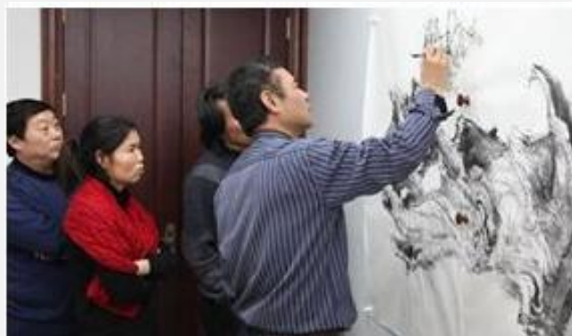
Figure 2: Watching the master at work is one of the most important elements in the learning process and a key to appreciate the art of Chinese painting

In relation to the above, watching the Masters at work is also a significant part of community and social gatherings, as has been observed during the visits to Liulichang. In the past, Chinese scholars often conducted literati gatherings where appreciating and sometimes producing an artwork or a piece of writing are done together, where artists, poets and writers share their views to enrich one other: an intellectual and social gathering such as one that has been finely articulated by Xie Huan’s painting “Elegant Gathering in the Apricot Garden” (figure 3). It is this cultural tradition that is unique in the practice and exhibition of traditional Chinese arts that should be continued and preserved. Even till today, there are many traditional Chinese painting associations and organisations all over China as well as in many Asian countries such as Singapore and Malaysia.