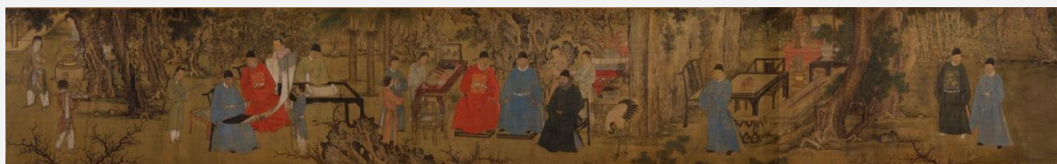
Figure 3: Painting of Xie Huan (1370-1450) entitled elegant gathering in the Apricot garden

Source: China Online Museum Website, http://www.chinaonlinemuseum.com/painting-xie-huan-apricot-garden.php , accessed in 2015