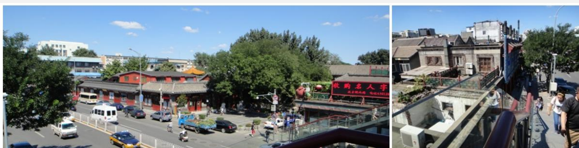
Figure 4: Bird-eye view of Liulichang art district: the interventions are done directly on the former building structures

The former cultural streets on the east and west that meet at the main intersection on the urban road have been restored according to its former neighbourhood street atmosphere. Old willow trees were remained along the street and encased with concrete block on which people can sit and relax. The