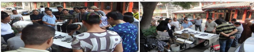
Figure 8: Extended courtyards and narrow alleys become intimate spaces for community-gathering