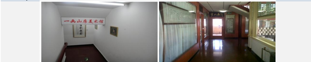
Figure 10: Development of Interior spaces from the existing buildings are used as art workshops, learning studios and demonstration spaces to encourage artists to demonstrate their art skills