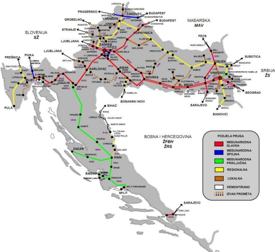
Figure 3 The Railway Connection of the City of Zadar on the Network of HŽ (the Croatian Railways)