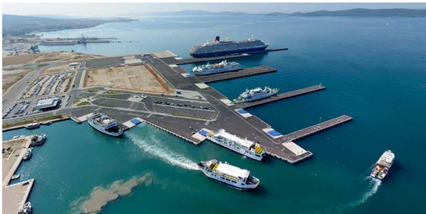
Figure 1 The Port of Gaženica

Due to its position in the heart of the Adriatic Sea, the Zadar County represents an important traffic hub that connects the north and the south of the Croatian coast and the Dalmatia region with other parts of Croatia as well as with other countries of the European Union and wider. Thanks to the highway A1 Zagreb – Zadar – Split – Dubrovnik, as a part of the Adriatic and Ionian traffic route with a connection to Zadar (Port of Gaženica), and to other state, county and local roads, air links (regular, low-cost and charter flights to a numerous foreign and domestic centres), sea links (ferries, ships, cruisers, etc.) and railway traffic, the area of the City of Zadar has become recognized as an easily reached destination with a numerous interesting sites in the city and its surroundings. A rich cultural heritage, areas of natural beauty with national and nature parks located nearby the city classify the City of Zadar at the very top of the Croatian tourist offer. The City of Zadar is a destination easily reached either by land, sea or air. It has a good traffic infrastructure through which it is directly connected to other larger Croatian cities like Zagreb, Rijeka, Split and Dubrovnik, with outstanding capacities and contemporary service of numerous marinas. The ferry port as well as the new cruiser port are located in the new spa-