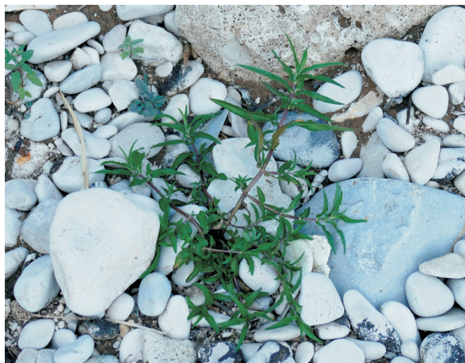
Fig. 1. Eclipta prostrata (L.) L. – habit on the island of Korčula.