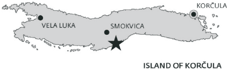
Fig. 3. Finding site of Eclipta prostrata in the bay of Stiniva on island of Korčula (indicated by star on the map).

(1982). Herbarium specimens of Eclipta prostrata (Herbarium ID: ZAGR 43638) have been deposited in the Herbarium ZAGR of the Faculty of Agriculture, University of Zagreb (BOGDANOVIĆ (ed.) 2017).