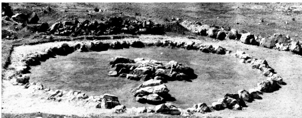
Figure 2. Burial 221 from Lchashen.

Calculus may harbour pathogenic bacteria which may lead to periodontal disease. Some authors defend that calculus deposition may be mainly related to consumption of protein-rich food, as fish or meat (46), whereas others have found that diets rich in carbohydrates may promote calculus deposition (47). It can be explained more logically by a specific occupational activity of the Sevan Basin inhabitants, which in turn points towards fishing activity.