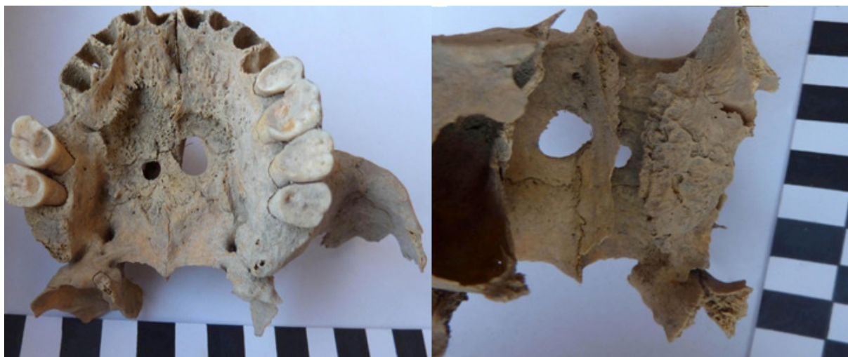
Figure 1. Perforation of the hard palate, with two small defects in the hard palate.