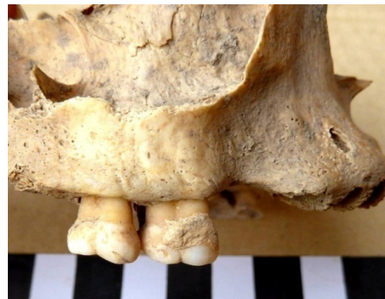
Figure 5. Periodontal disease, tooth lost antemortem and dental calculus