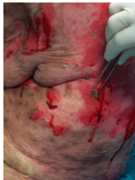
Figure 5. Removal of dead skin.

toxic reaction against the offending drug or its metabolites. Drugs can stimulate the immune system by binding directly and reversibly to immune receptors. The prevalence of antibiotics being responsible for TEN ranges from 29% to 42% (12). Almost all antibiotics have been implicated, but beta-lactam and sulfonamide are most commonly associated with TEN, and TEN usually develops within the first week of antibiotic therapy. In our case, TEN was diagnosed based on the clinical picture, and drugs we most suspected as the cause were antibiotics, due to the direct relation