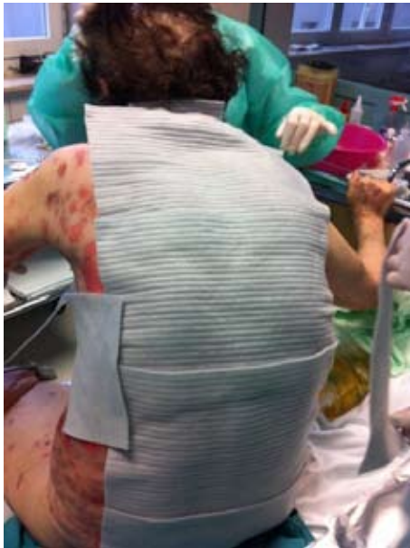
Figure 3. Lining placement.

painful hemorrhagic erosions and crusting over the lips, restricting her oral intake. The rapid progression of the oral erosions and desquamation on most of the patient's body surface area led us to suspect TEN as the diagnosis. Since it was assumed that the antibiotics caused TEN, all antibiotics were excluded from the therapy. Because of the severity of TEN – the SCORTEN score was 4 (Age >40, glucose >250 mg/dL, heart rate >120/min, compromised body surface >10%) indicating a 58.3% mortality rate – the patient was given intravenous immunoglobulin therapy 1 g/kg over 3 days. She also received fluid resuscitation, and the wounds were treated with Aquacell® Ag (ConvaTec) and vaseline gauzes (Figure 3 and 4). The dressings were changed periodically following cleaning with saline and gentle debridement of exfoliated epidermis (Figure 5 and 6). After 15 days of local therapy, almost full re-epithelialization was achieved (Figure 7 and 8), and the patient was generally in good condition, without active inflammatory changes. A few days later, despite improvement, she developed a sudden bradycardia that did not respond to reanimation procedures. The patients died after 18 days in the ICU from a massive heart attack, according to autopsy reports.