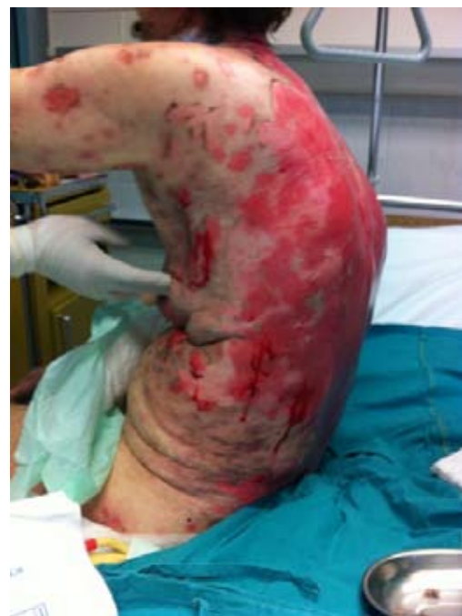
Figure 2. Peeling of the affected skin.