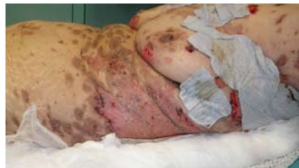
Figure 8. Re-epithelialization

fully achieved after 15 days of combination of local therapy and IVIG.