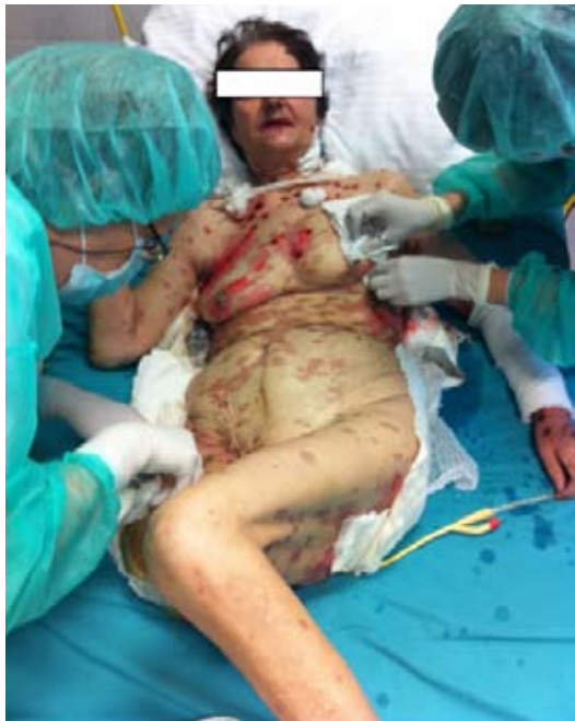
Figure 6. Removal of dead skin.

between the onset of the disease and the administration of an antibiotic. Our patient received antibiotics three days before the full clinical picture was evident. However, since the patient was receiving multiple antibiotics, it was difficult to determine which antibiotic was causing the skin reaction. An improvement in the general condition of our patient after the withdrawal of antibiotics may provide indirect evidence for a causative role of antibiotics as a potential agent for TEN in our case.