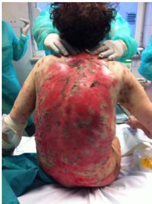
Figure 1. Peeling of the affected skin.