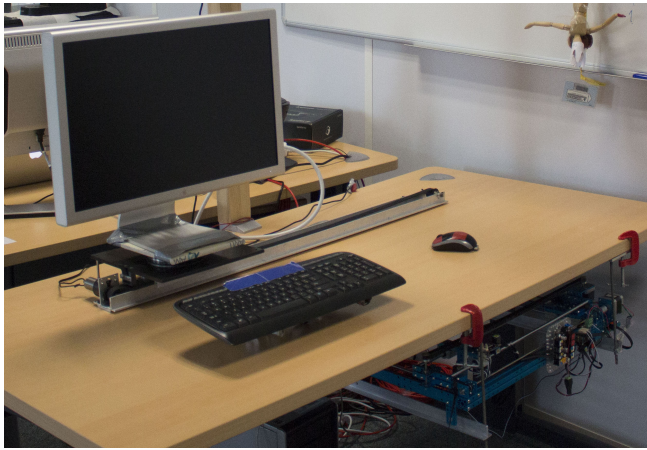
Figure 3: The Living Desktop is a concept in which desktop peripherals can move around on the desk.