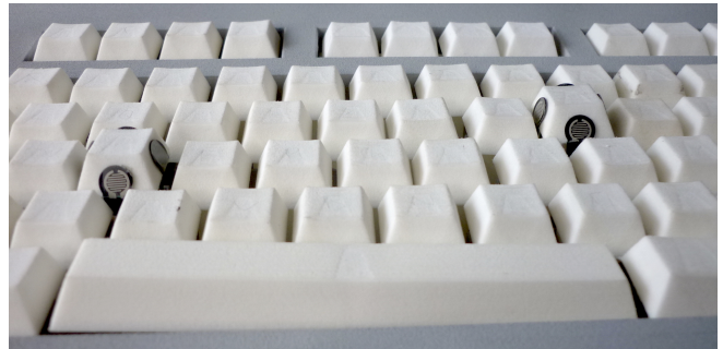
Figure 1: Métamorphe is a keyboard with actuated keys, which can either be up or down.

Our previous studies showed that raising keys eases eyes-free interaction with the keyboard. Specifically we observed that users can easier locate raised keys and surrounding ones.