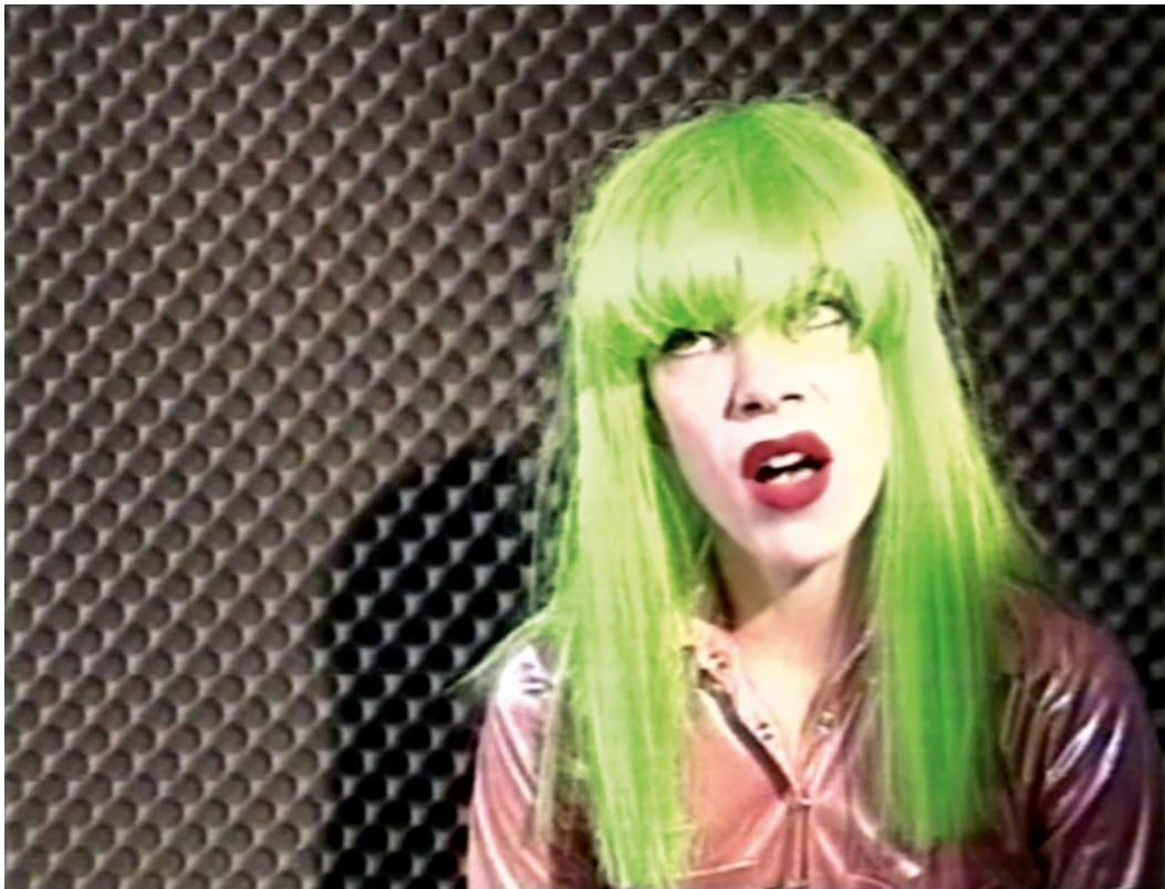
Figure 8. Alex Bag, Untitled Fall '95 , 1995 video, dimensions variable