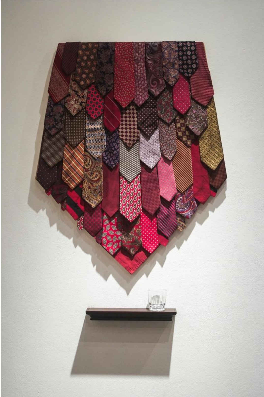
Figure 15. Rachel Ballard, Choke , 2017 neck ties, wood, and whiskey glass, 26 x 26 x 3 in.