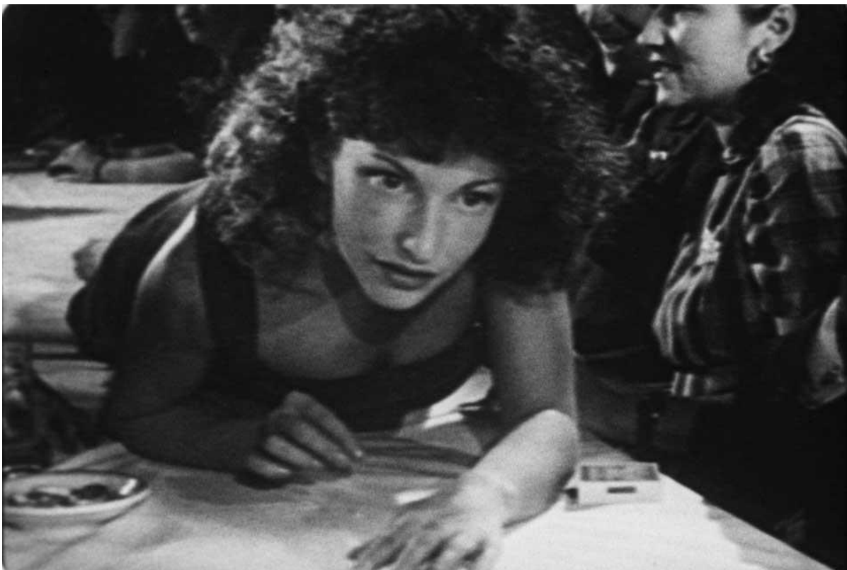
Figure 5. Maya Deren, At Land , 1946