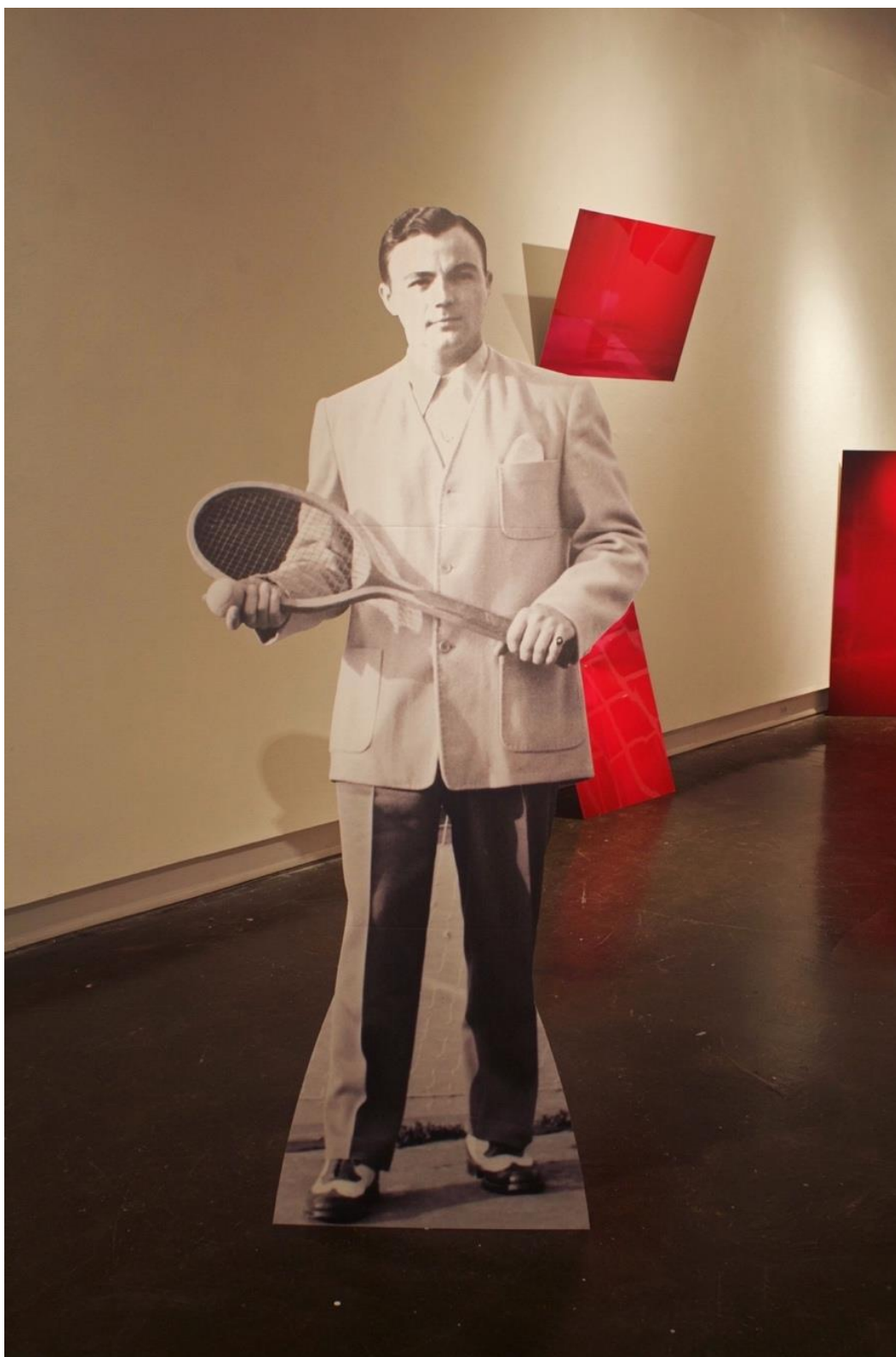
Figure 16. Rachel Ballard, Dick , 2017 foamcore, 72 x 24 in.