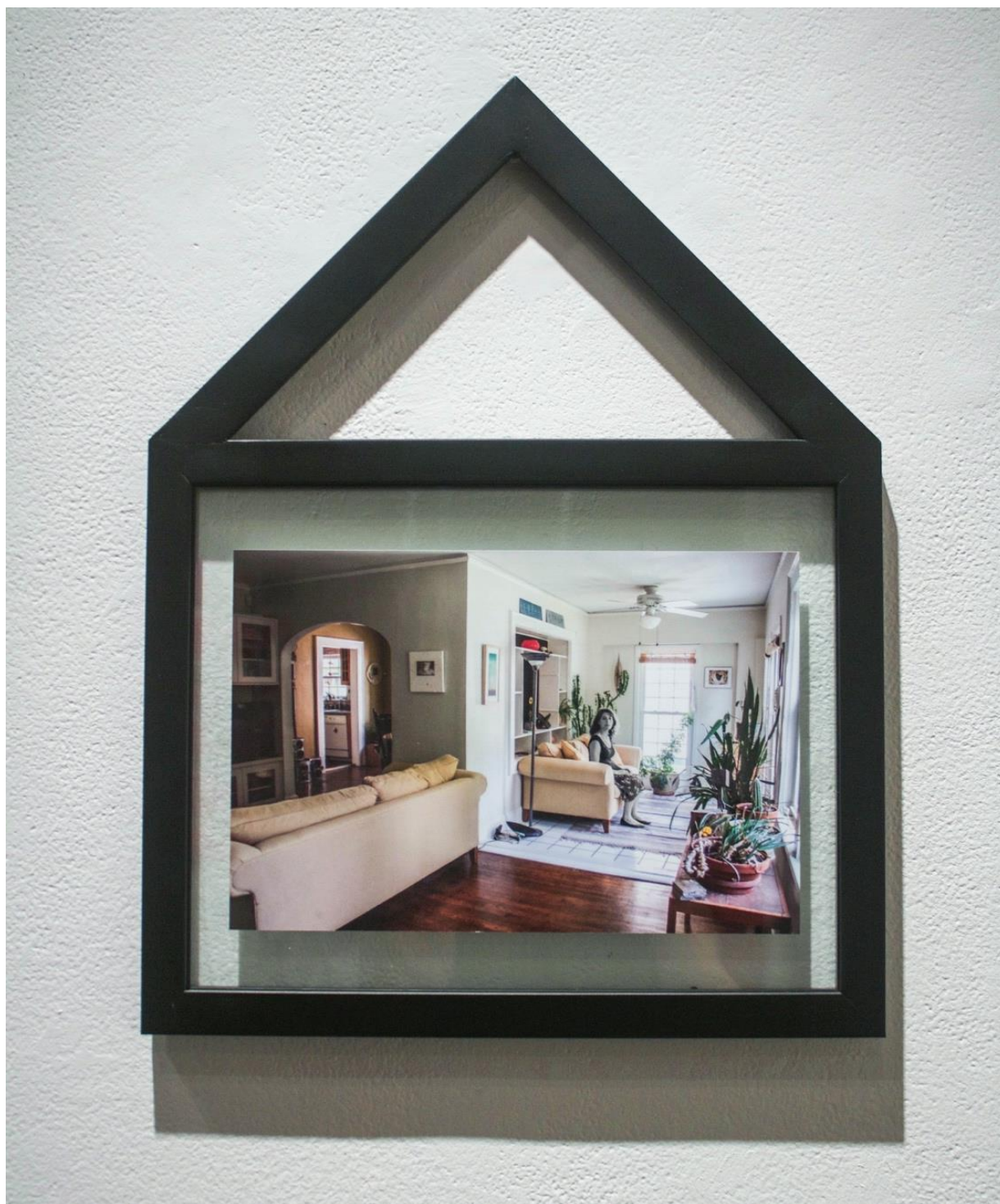
Figure 10. Rachel Ballard, Mrs. B , 2017 archival pigment print and wooden frame, 10 x 1 x 14 in.