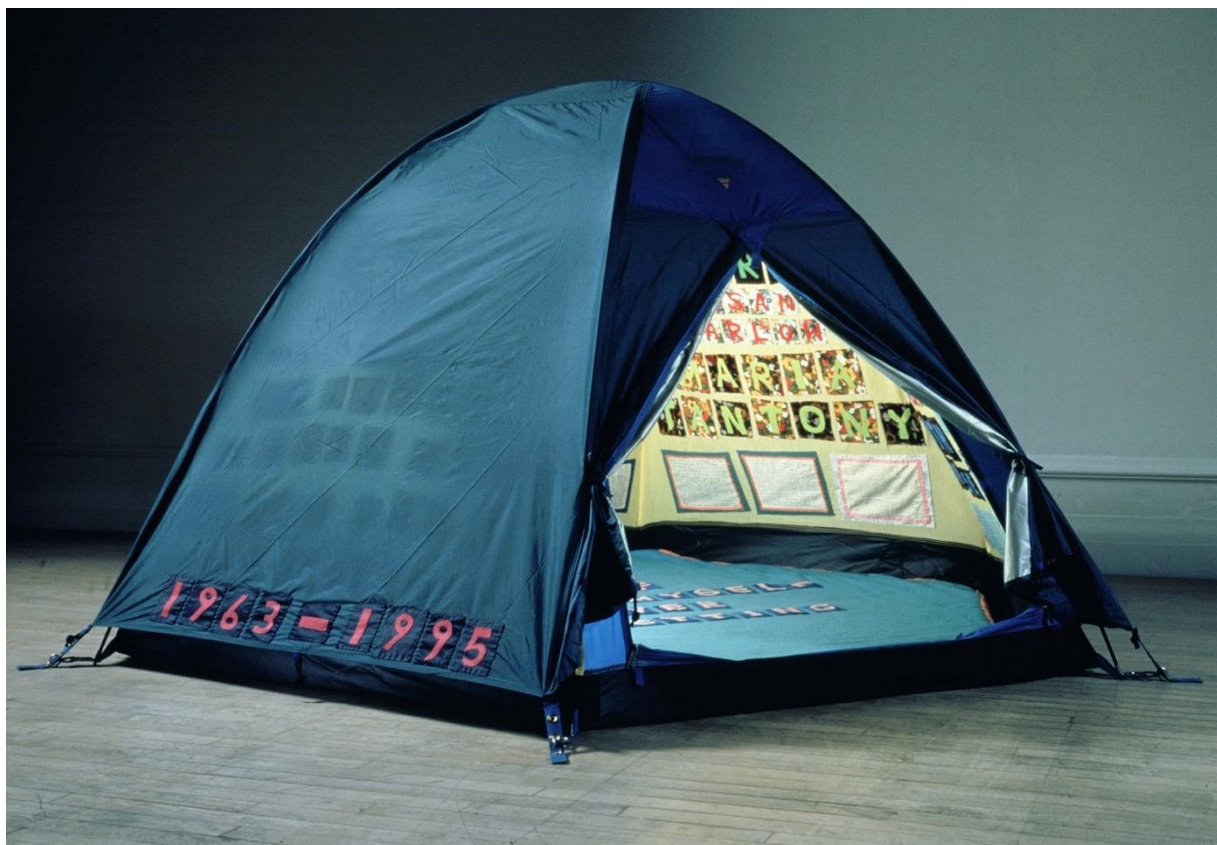
Figure 2. Tracy Emin, Everyone I Have Ever Slept With 1963-1995 , 1995 appliqué tent, mattress and light, 48 x 96½ x 84½ in.