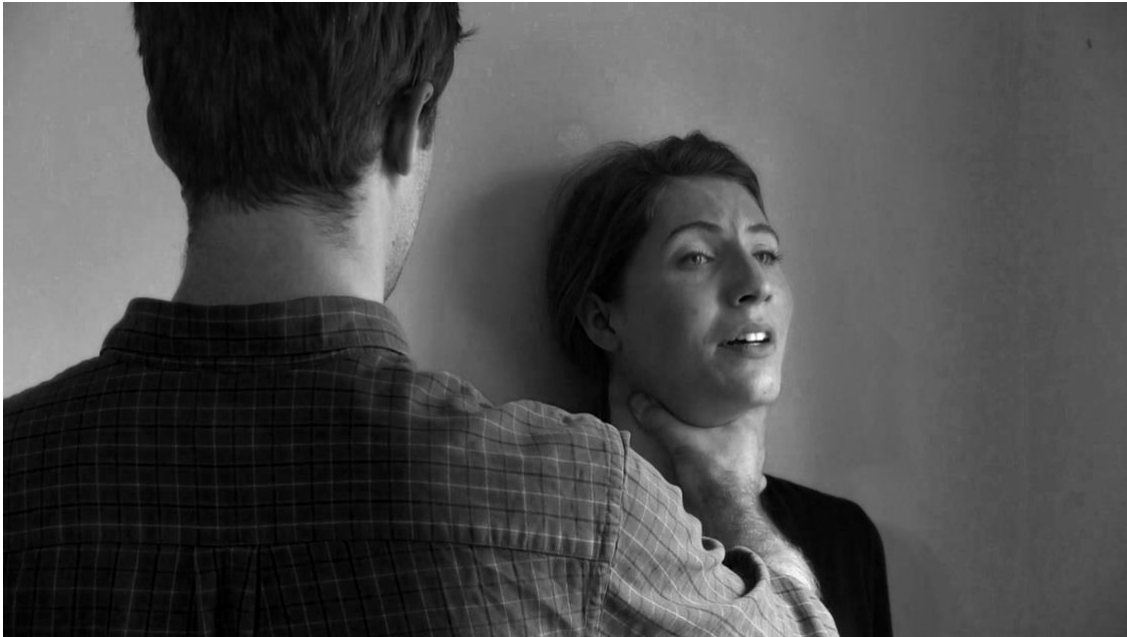
Figure 14. Rachel Ballard, A Day For You , 2017 digital video, dimensions variable