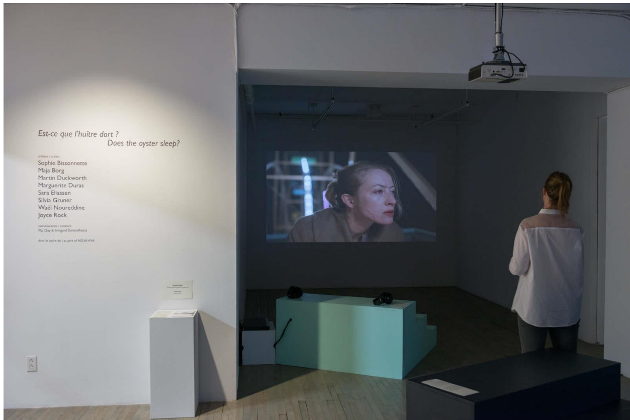
Figure 6. Installation view of Sara Eliassen's A Blank Slate , 2014 during Does the Oyster Sleep? exhibition at SBC Gallery of Contemporary Art in Montréal, Québec, 2016