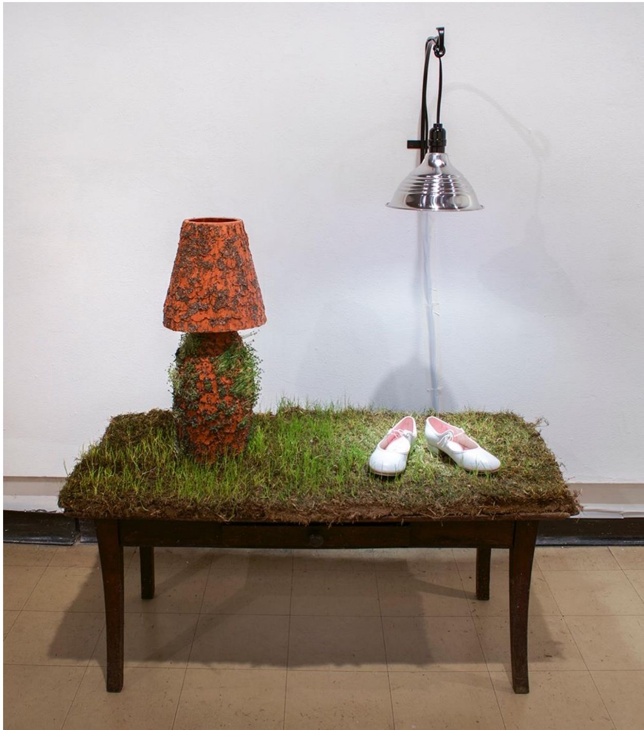
Figure 9. Rachel Ballard, Let's Think About This Realistically , 2016 sod, found table, earthenware, chia seeds, tap shoes, and grow light, 20 x 12 x 6 in.