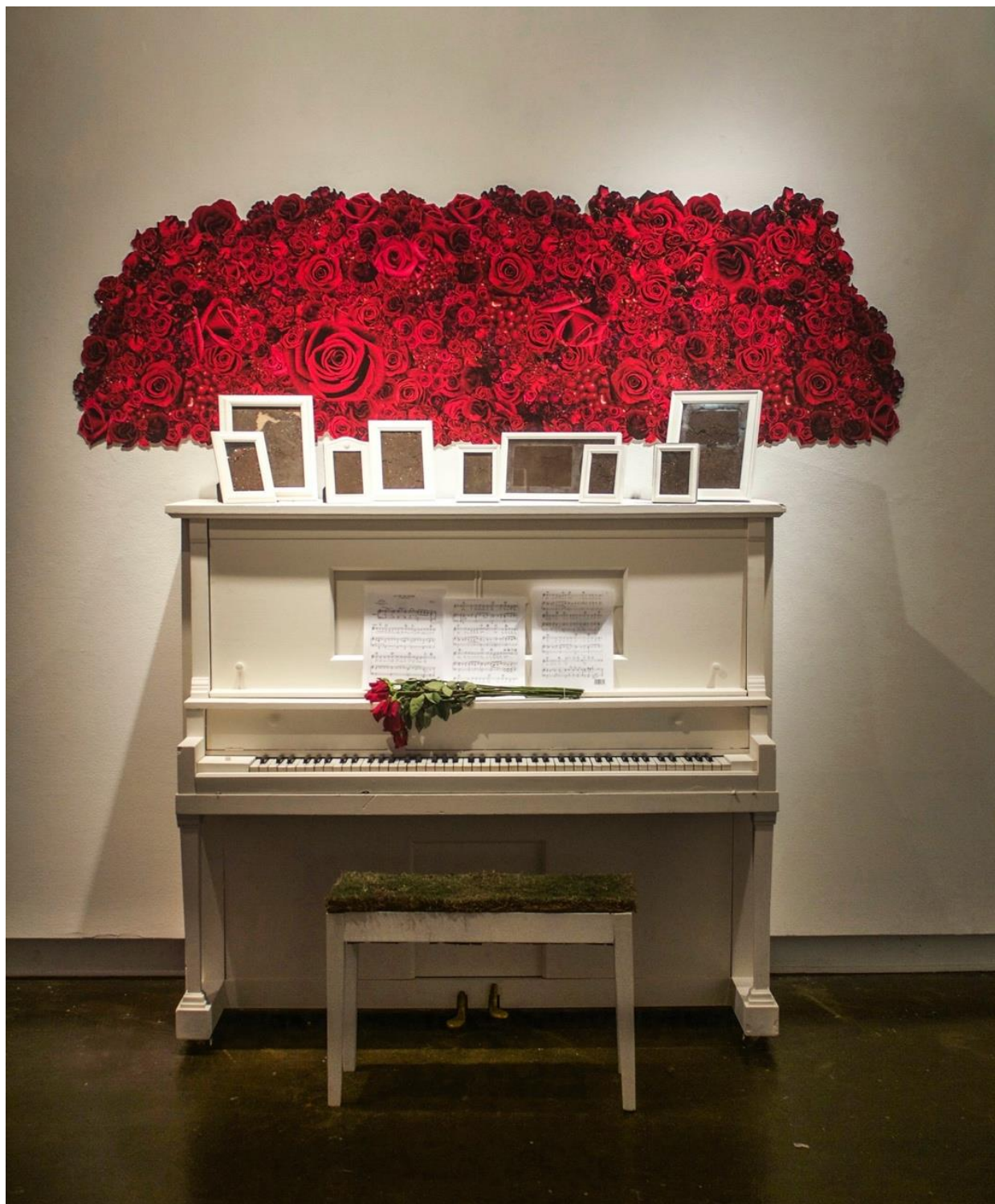
Figure 17. Rachel Ballard, La Vie en Rose , 2017 white upright piano, foam core, picture frames, soil, sheet music, sod and roses, 36 x 72 x 96 in.