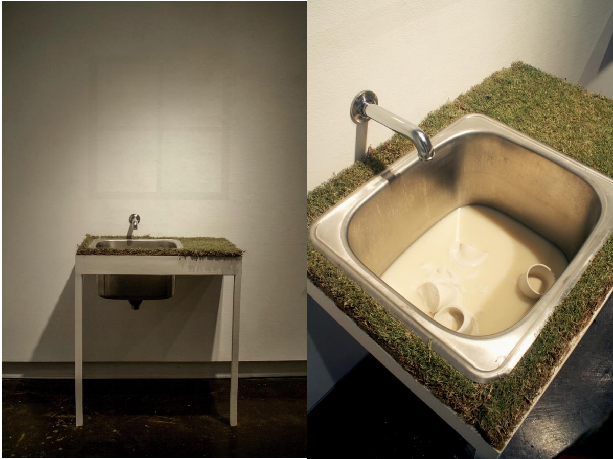
Figure 12. Rachel Ballard, I think it's your turn , 2017 clear high-gloss paint, wood, sod, stainless steel and porcelain, 36 x 21 x 13 in.