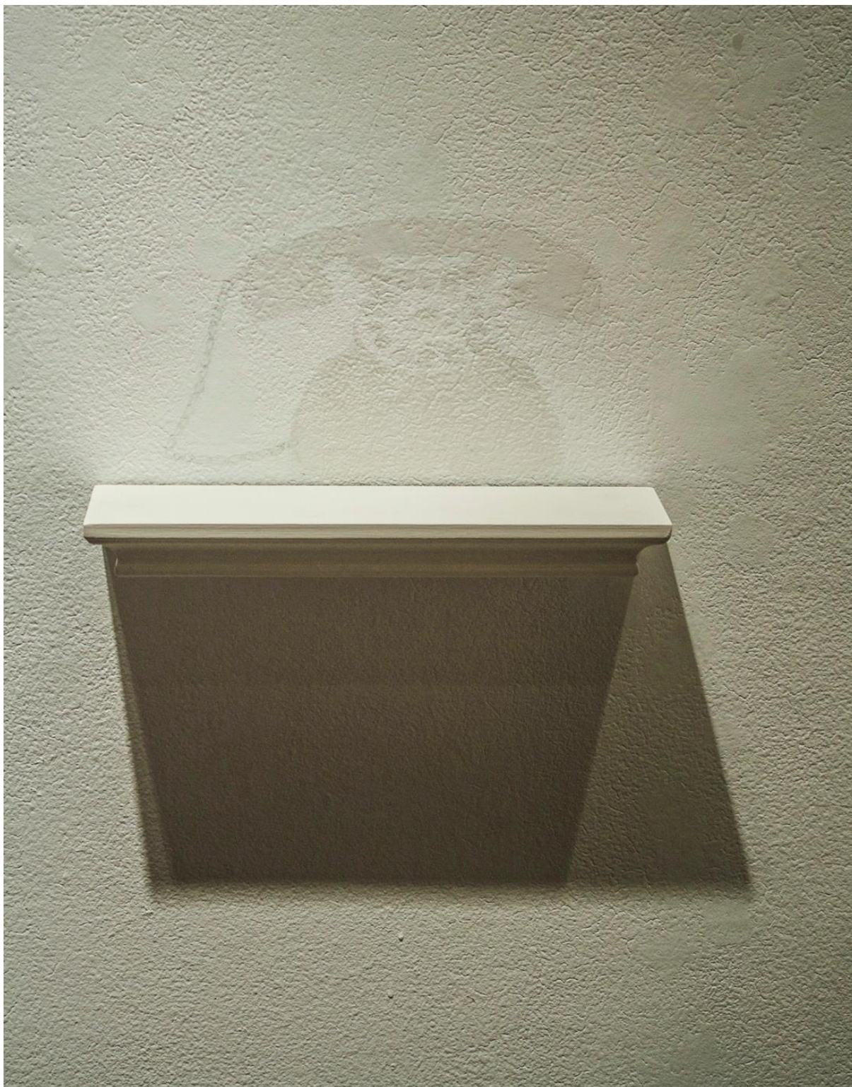
Figure 11. Rachel Ballard, Listen , 2017 clear high-gloss paint and wood, 18 x 24 x 8 in.