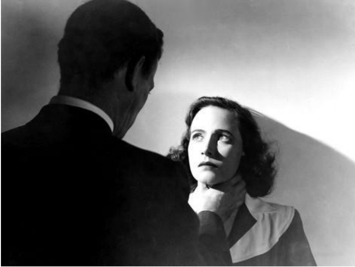
Figure 13. Alfred Hitchcock, Shadow of a Doubt , 1943