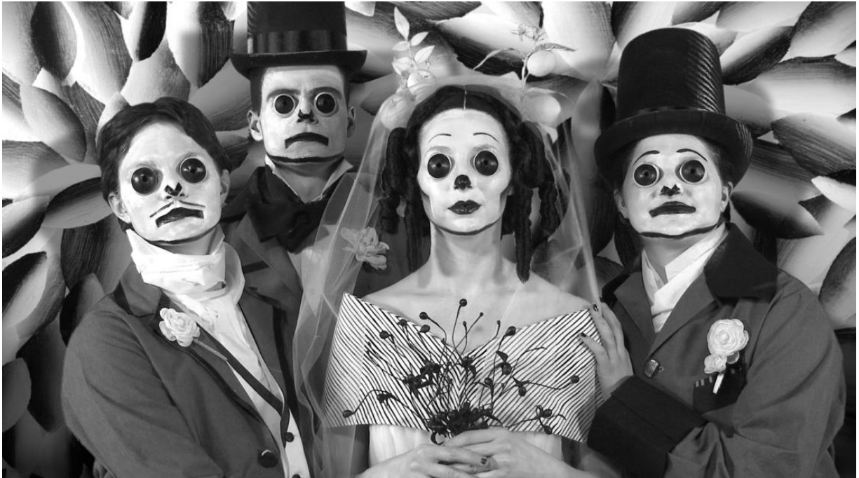
Figure 4. Mary Reid Kelley, The Syphilis of Sisyphus , 2011 digital video, dimensions variable