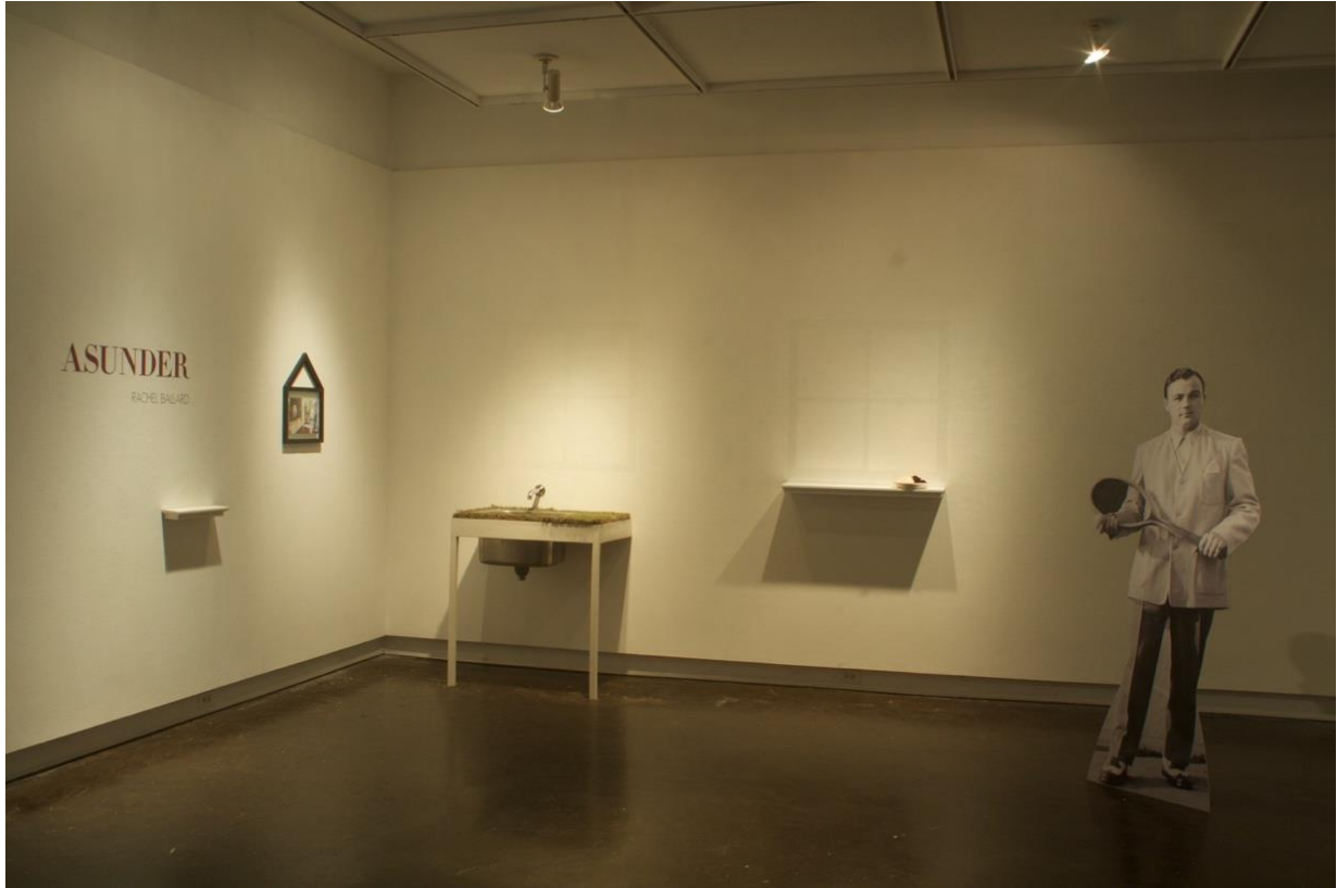
Figure 20. Rachel Ballard, Asunder Installation View 3, 2017