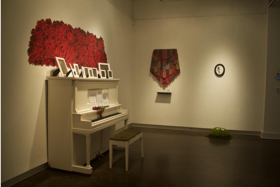
Figure 18. Rachel Ballard, Asunder Installation View 1, 2017