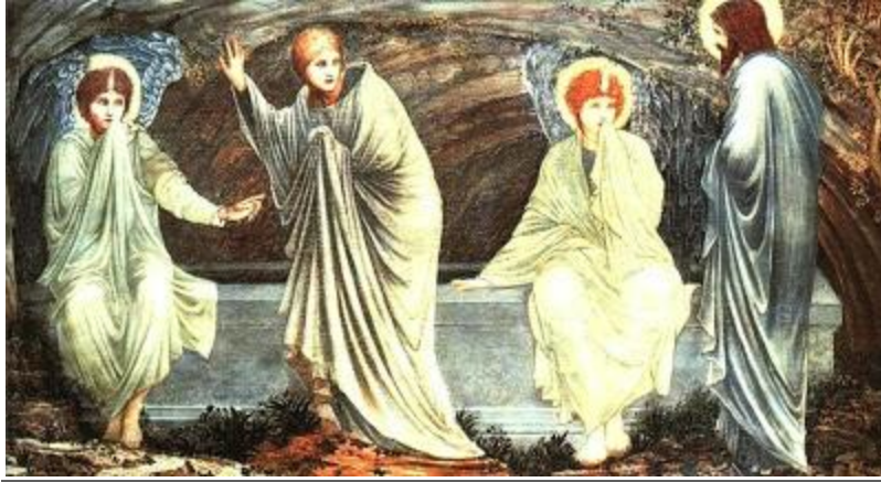
Fig. 5 The Morning of the Resurrection by Edward Burne-Jones, 1882

http://iconsandimagery.blogspot.com/2011/04/title-morning-of-resurrection-artist.html