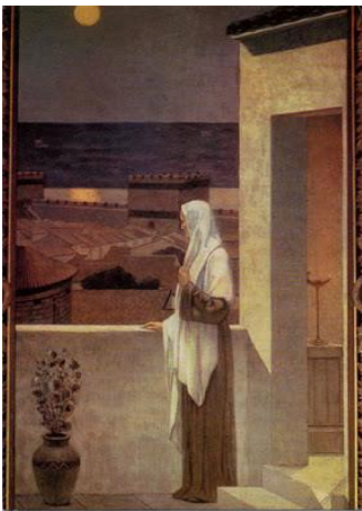
Fig. 8 St. Genevieve solicitously watches over the sleeping town (detail of fresco, The Pantheon, Paris) by Pierre Puvis de Chavannes, 1898

https://www.wikiart.org/en/pierre-puvis-de-chavannes/life-of-st-genevieve