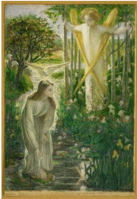
Fig. 6 The Annunciation by Dante Gabriel Rossetti, 1855

http://iconsandimagery.blogspot.com/2011/04/title-morning-of-resurrection-artist.html