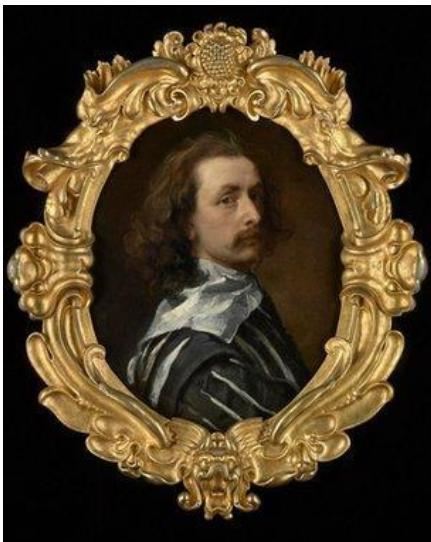
Fig. 2 Self-portrait by Anthony Van Dyck, 1640-41

http://www.bbc.com/news/entertainment-arts-27230586