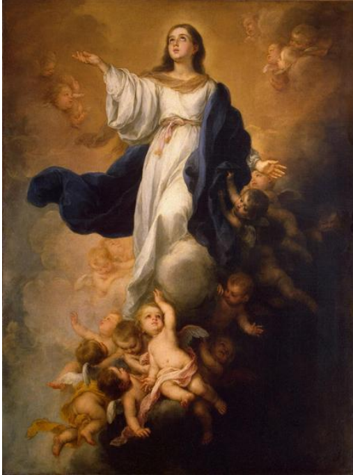
Fig.3 The Assumption of the Virgin by Bartolome Esteban Murillo, 1670

https://www.wikiart.org/en/bartolome-esteban-murillo/the-assumption-of-the-virgin-1670