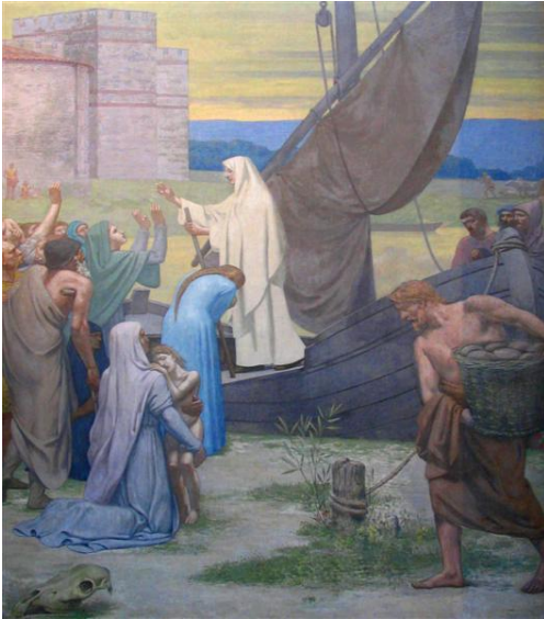
Fig. 7 Childhood of St. Genevieve by Pierre Puvis de Chavannes, 1877

https://www.wikiart.org/en/pierre-puvis-de-chavannes/life-of-st-genevieve