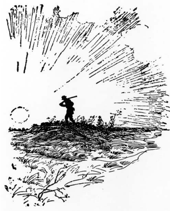
Fig. 1. Illustration for My Ántonia by W.T. Benda, 1918