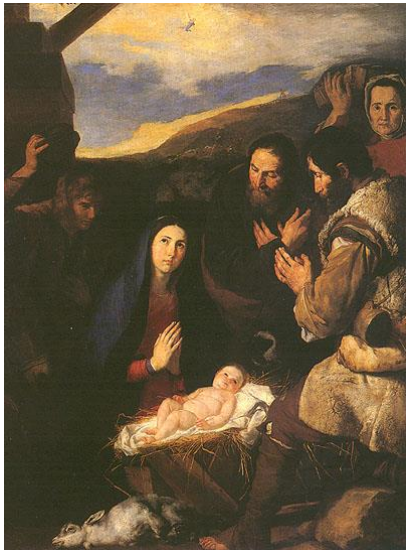
Fig. 4 The Adoration of the Shepherds by Jusepe de Ribera, 1650

https://www.wikiart.org/en/bartolome-esteban-murillo/the-assumption-of-the-virgin-1670