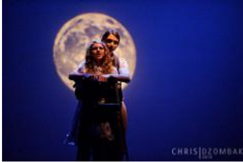
Fig. 9 Our Town , PHS/Act 2 Theatre Company production, Pinckney, Michigan, Nov.

2010 https://www.flickr.com/photos/chrisdzombak/5279288166/