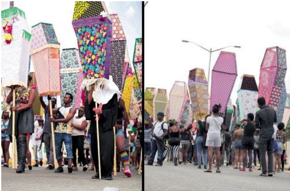
Figure 1 Ebony G. Patterson, "Invisible Presence: Bling Memories." (2014)