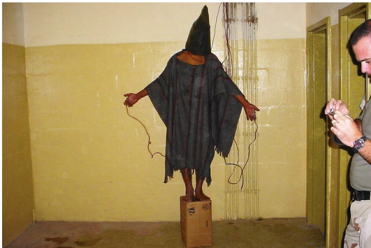
Figure 3 "Untitled" Abu Ghraib (2003)

Chrononormativity in neoliberalism, 25 as well as regulatory and ideological state apparatuses, 26 functions by enacting violence upon othered bodies, and this violence is made justifiable and acceptable through the assurance of the incommunicability of pain. This confidence of incommunicability is explored in depth by Nicole Archer in her article “Security Blankets: Uniforms, Hoods, and the Textures of Terror,” in which Archer writes about the power of illegibility and anonymity through the discussion of the violence of hooding. Archer references a very famous photograph of a torture scene from Abu Ghraib in which a man, whom the audience is supposed to assume to be a suspected terrorist, with a hood covering his entire head is standing on a box with his arms spread out to his sides with wires hanging off of them.