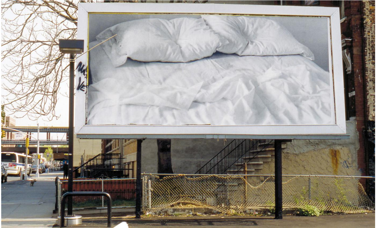
Figure 7 Felix Gonzalez-Torres, "Untitled" (billboard of an empty bed). (1991)