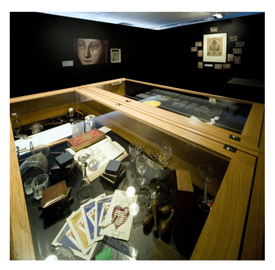
Figure 1: Installation view of The Story of Things .

. . . our intuitive notion of truth in fiction is the notion of something that admits of degree. ( Currie 91)