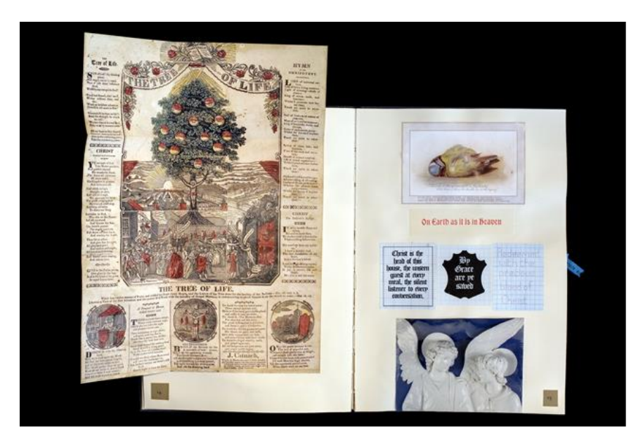
Figure 5: Double page spread from Scrapbook (the story of things) by Carson & Miller, published by Manchester Metropolitan University Special Collections, 2009.

artist-curators, our unreliable position was that we were not fictional, that (while we did believe things) our beliefs were – indeed are – at the same time, fluid, subject to change, and therefore unreliable. The unreliability came not from a lie but from our beliefs; these beliefs were influenced by, but not necessarily founded in, the grand narrative. Our perception was not linear but was multi-faceted, allowing for numerous meanings; indeed we held multiple views of the same artifact at any given moment resulting, therefore, in further negotiation of meaning.