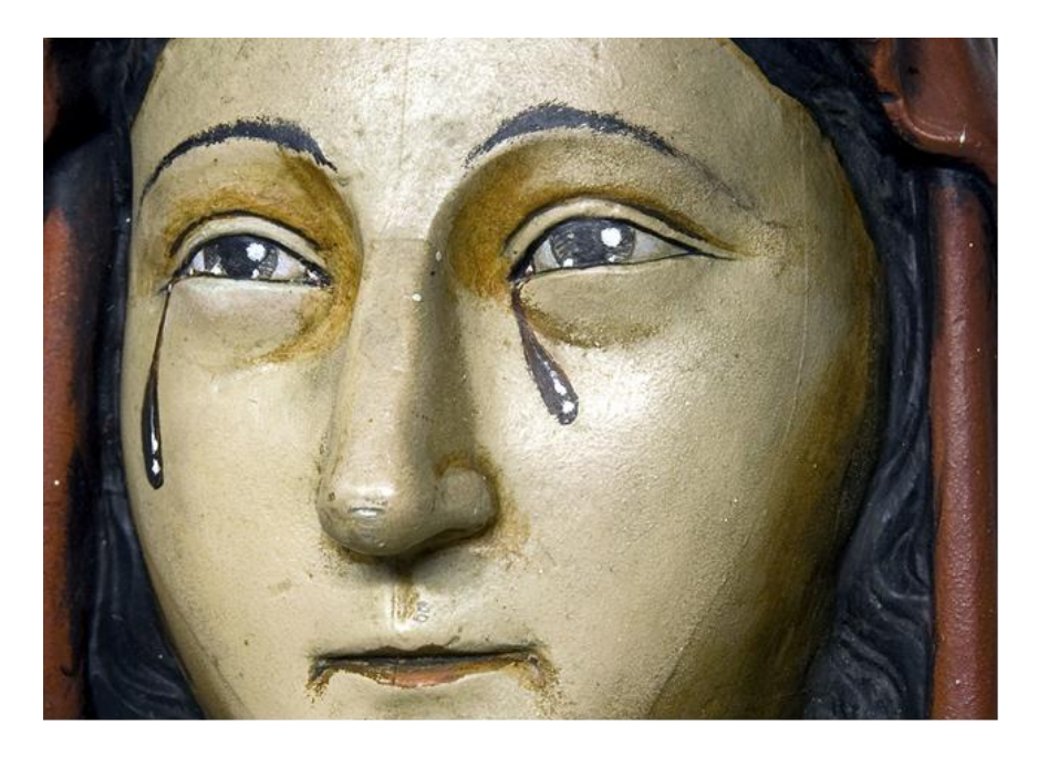
Figure 7: Photograph showing a detail of a cast (1897) of an effigy from a thirteenth century tomb in the Cathedral St. Denis, Paris.

In creating Scrapbook , we took the principles of the Wunderkammer and framed them within album pages. Ott, Tucker, and Buckler note an important historical relationship between the Wunderkammer and the scrapbook: