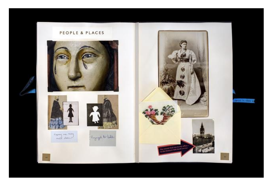
Figure 8: Double page spread from Scrapbook (the story of things) by Carson & Miller, published by Manchester Metropolitan University Special Collections, 2009.