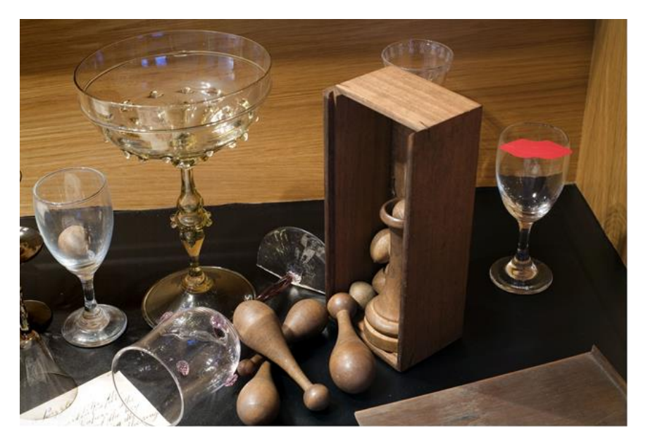
Figure 6: Detail of an exhibition cabinet from The Story of Things . (Featuring red PVC "Lellebel" ear clip by Herman Hermsen, 1983. © Herman Hermsen).

museum (that is, the various arrangements in which these artifacts would be found in the museum storage areas), these "things" had not previously been put into contact with one another; a new dialogue emerged through our arrangement. The contents of the cabinet (a detail of which is provided in figure 6) presented a chaotic display; a broken glass lay next to overturned skittles and a lip-shaped ear clip was perched on the rim of a wine glass. This arrangement, along with others in the exhibition, turned away from conventional museum presentation; here, things were placed yet mis-placed, joined and dis-joined, related and separated. This arrangement acknowledged the qualities of these objects and also set up a relationship between the different categories of objects within the case. We had experienced these categories "behind the scenes" where we saw objects related by type – glass objects were stored together, wooden artifacts kept side-by-side.