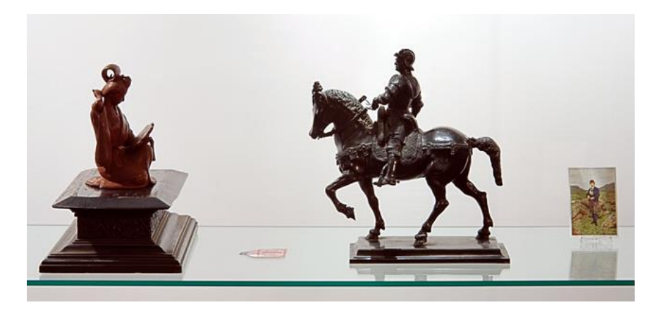
Figure 2: Detail of an exhibition cabinet from The Story of Things .