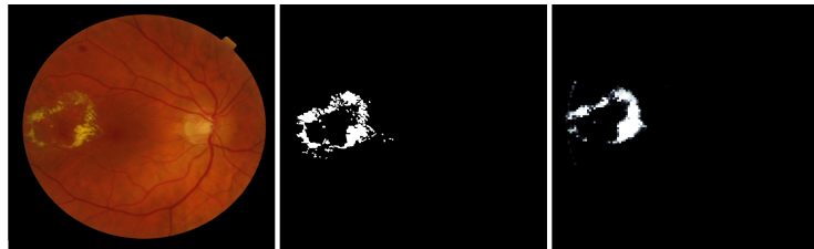
Figure 2. Eye fundus image with DME from test dataset, ground truth generated by expert ophthalmologist and exudates automatic label by exudate-detection model

We assessed the ability of the ED model with the best parameters to create a mask from the test dataset that was randomly selected. Figure 2 presented an eye fundus image of 1440 \times 960 pixels, ground truth generated by expert ophthalmologist and the mask generated using the exudate-detection CNN to classify patches as exudates if the output of the softmax layer is above 0.75; otherwise, it was classified as a healthy patch.