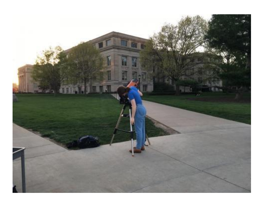
Everyone attaching the telescopes!