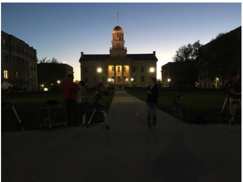
People stopping by!