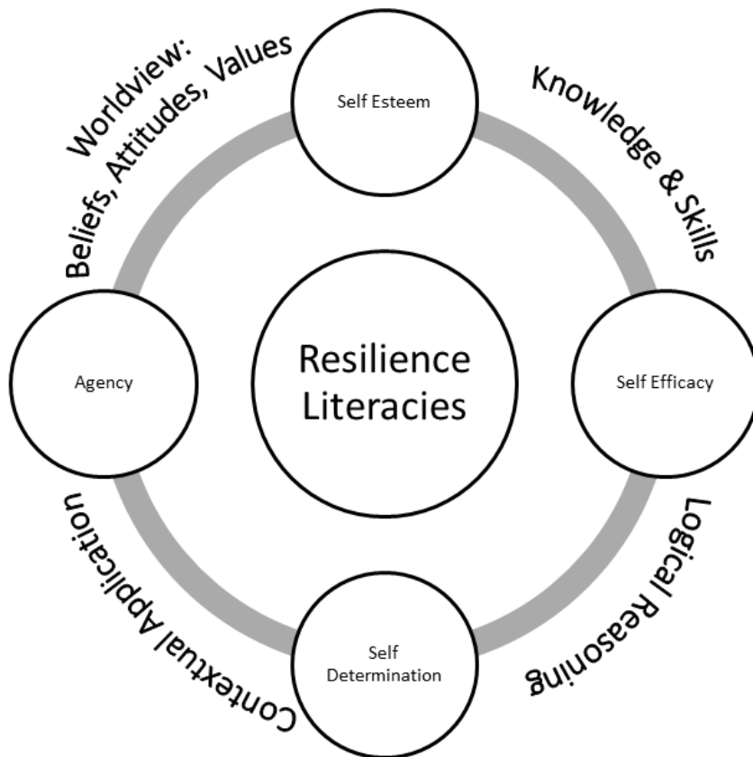
Figure 1 Resilience Literacies Model

A critical turning point in the development of this transformative theory of learning and teaching is the reaffirmation of the centrality of positive relationships. There has been quite a bit of academic discourse on Va (relational space) and Va Tapuia/ Veitapui- (sacred spaces) 5 . In my study, I found that Va is central to understanding sustainability. It is not a metaphor for sustainability. It is the lived praxis of sustainability – we nurture the spaces between people, between humans and nature, and between communities and the cosmos. As a philosophy, a worldview, a pedagogical practice – a praxis - Va is the embodiment of sustainability and resilience and therefore critical to the learning and teaching and teacher education dialogue. It was this understanding that brought the various components of the Tuli framework together into a cohesive holistic model.