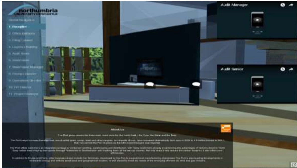
Figure 1 Screen shot of reception area of the audit simulation client

method is the allowance for group work skills to be used/developed as would be experienced in future employment.