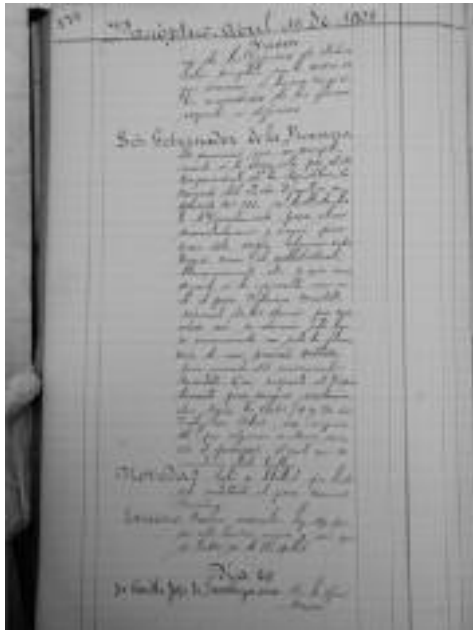
Garcia Moreno Archive, 2014

Ecuador's former Vice-president to convert an occupied cell into a make-shift treatment office for alcoholics and homeless. The entry begins as follows: 'Sir Province Governor: In response to the order given by the Republic Vice-president, who is currently in charge of Executive Power by fiat No. 333, the Department for the treatment of chronic alcoholics and homeless is ready.'