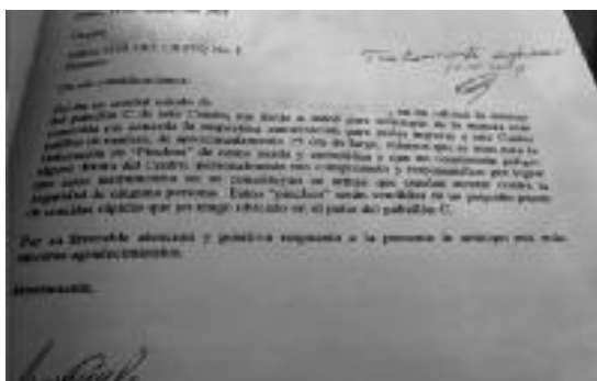
Garcia Moreno Archive, 2014

In its archive, the Panopticon of Quito synthesises the dialectics of penal bureaucracy and the free-market. The image below is an official request by a prisoner to bring in sticks to sell 'pinchos' (meat skewers). The application reassures the prison warden that the requestor takes full responsibility for the everyday use of long pieces of wood assuring him that they 'will not constitute in any manner a weapon that may endanger others.' Similar requests abound in the prison archives: