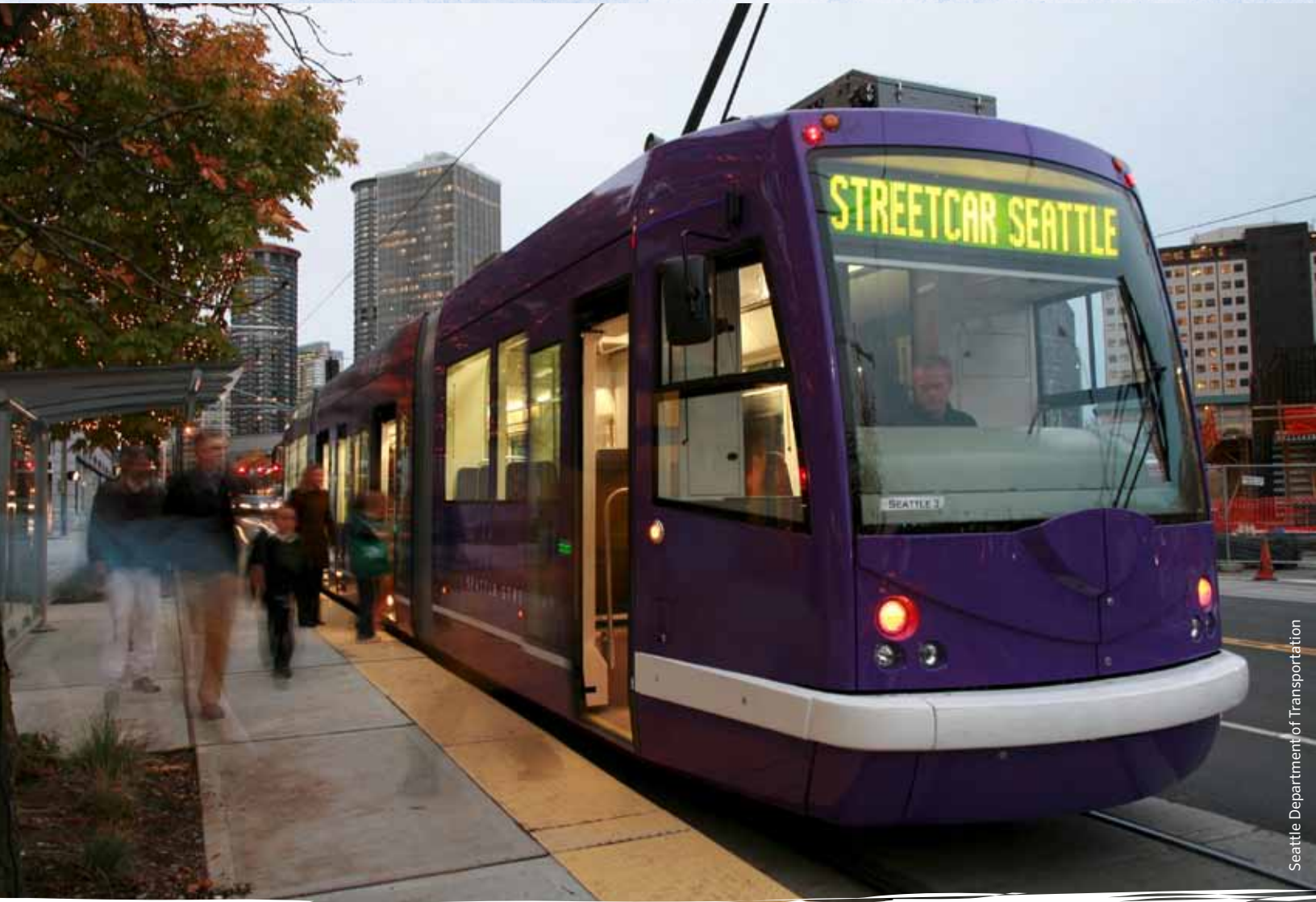
Seattle Department of Transportation