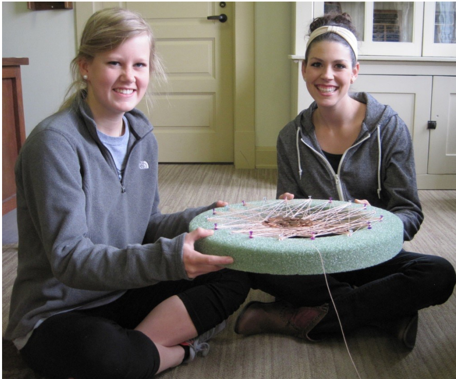
Figure 3. Human-made web. After examining natural spider webs, preservice teachers determine the best way to improve the natural design.

Student performance in this STEM activity could be assessed by determining the degree to which the teams utilized the engineering design loop; determining whether the students applied knowledge of geometry, measurement, shapes, and spacing; and evaluating the improvements made to the final product based on the team testing with coins. Finally, teams could be assessed on their ability to describe the process used to create their human web during the team presentation.