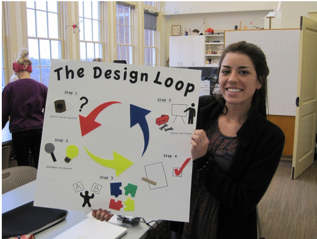
Figure 1. The design loop project. Preservice teachers personalized their own design loop by including pictures and elements that would aid younger students within the elementary classroom.

mobile. The students conduct background research on mobiles (the only art form to originate in the United States), gather information about the nature of science and the human-made world from informational texts such as Alexander Calder and His Magical Mobiles by Jean Lipman and Margeret Aspinwall (1981) or Mobiles: Building and Experimenting with Balancing Toys by Bernie Zubrowski and Roy Doty (1993), and then locate artifacts that can be arranged in a state of equilibrium to represent the relationship between nature and technology. This experience shows students how the individuals that they just read about in the informational text went about solving the problems that they faced. The engineering design loop has the potential to be used as a resource for students to solve a variety of problems inside and outside of the classroom. The experience of solving the activity will provide multiple ways for our students to learn and retain information as well as provide an interest for continued learning.