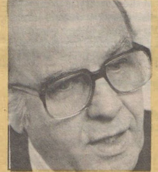
Above: Gaylord Nelson who founded Earth Day. PC's Earth Day activities. Page 2