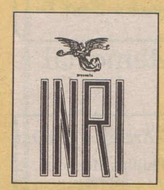
"INRI". See page 5