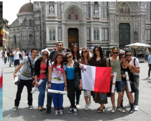
GCHSS students and teachers during a school trip to Florence (Italy)