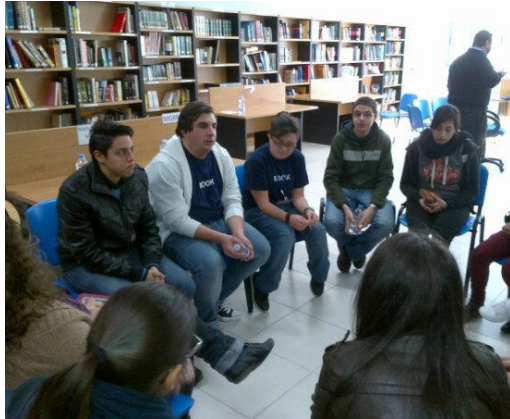
The telling of and listening to personal narratives GCHSS Human Library Day 2013