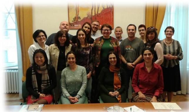
Participants during the CEDEFOP study-visit Marketable skills through teaching languages for specific purposes- Hungary (Gauci, 2014).

innovative methods (Brown, 2014b; Gauci, 2014). The study-visits opened avenues for long-term networking and created the possibility for bilateral cooperation between the participating countries on the level of staff and students exchange; developing joint programmes; and the effective creation of a virtual space for exchanging adequate knowledge, materials and information (Brown, 2014b; Gauci, 2014).