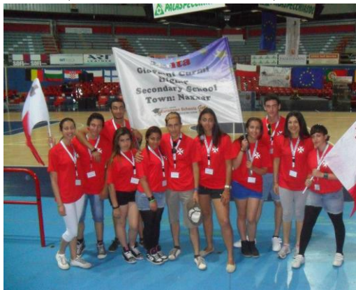
GCHSS Students and Teachers participating at the ESCOT European Schools Gala Montecatini (Italy)