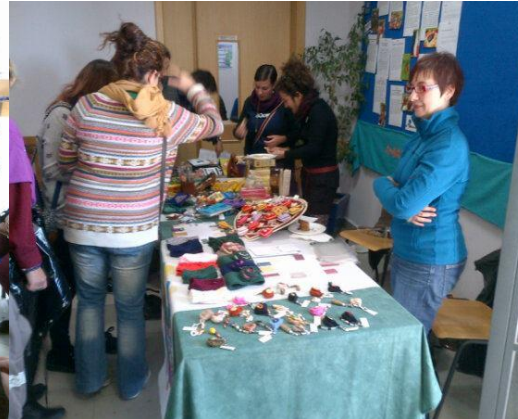
Fund-raising through selling of artefacts made from recycled materials GCHSS Human Library Day 2013