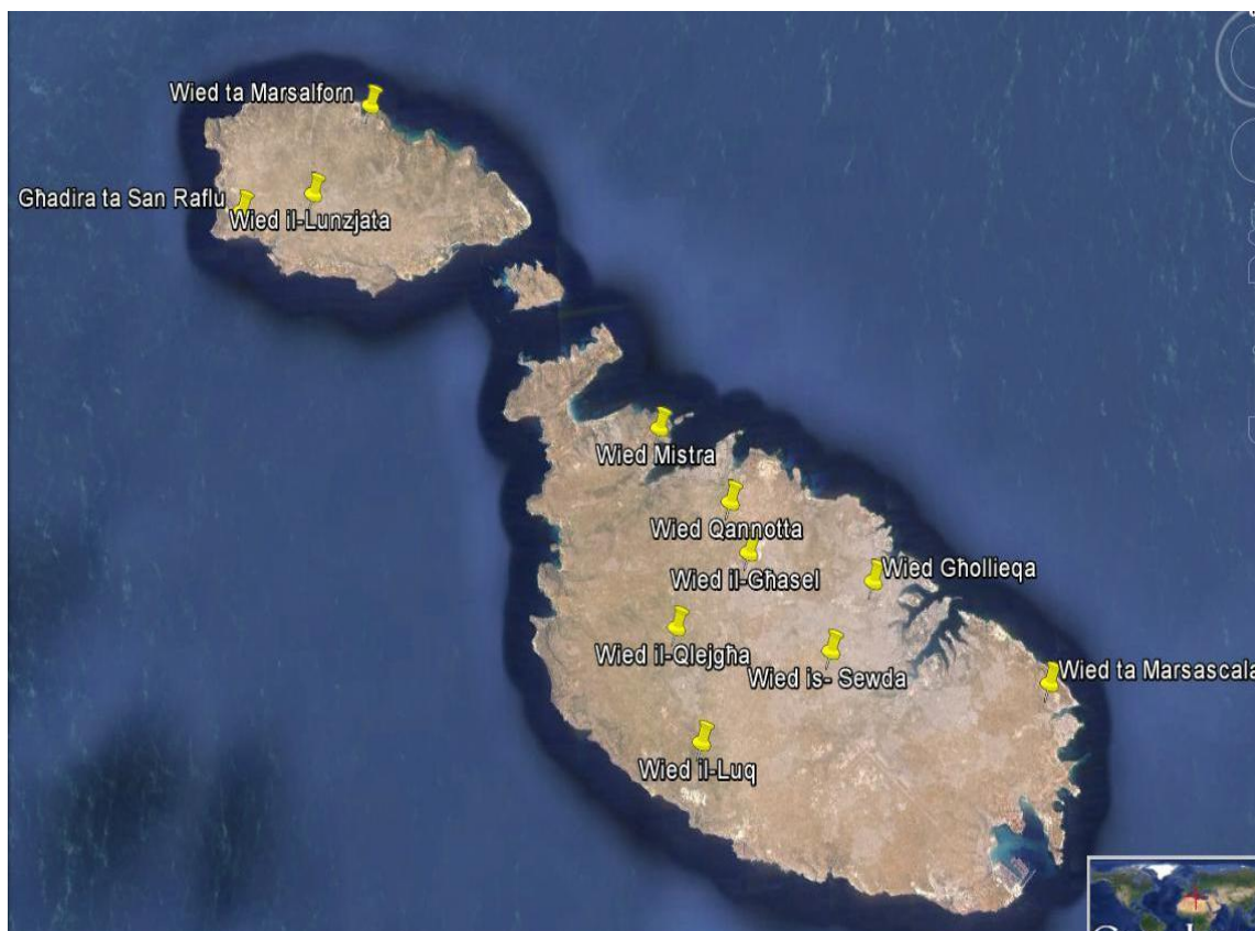
Fig.1 Eleven stations distributed over both islands of Malta & Gozo.