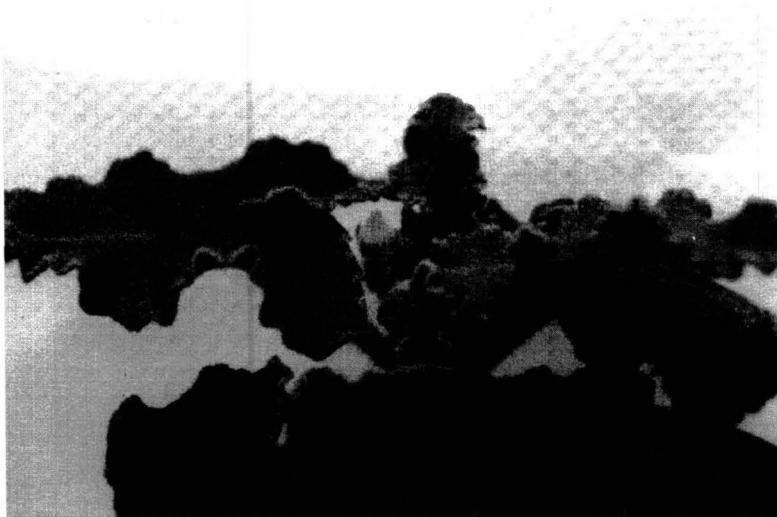
Fig. 2. Flowering and fruiting of the micropropagated E. elaterium plantlets.