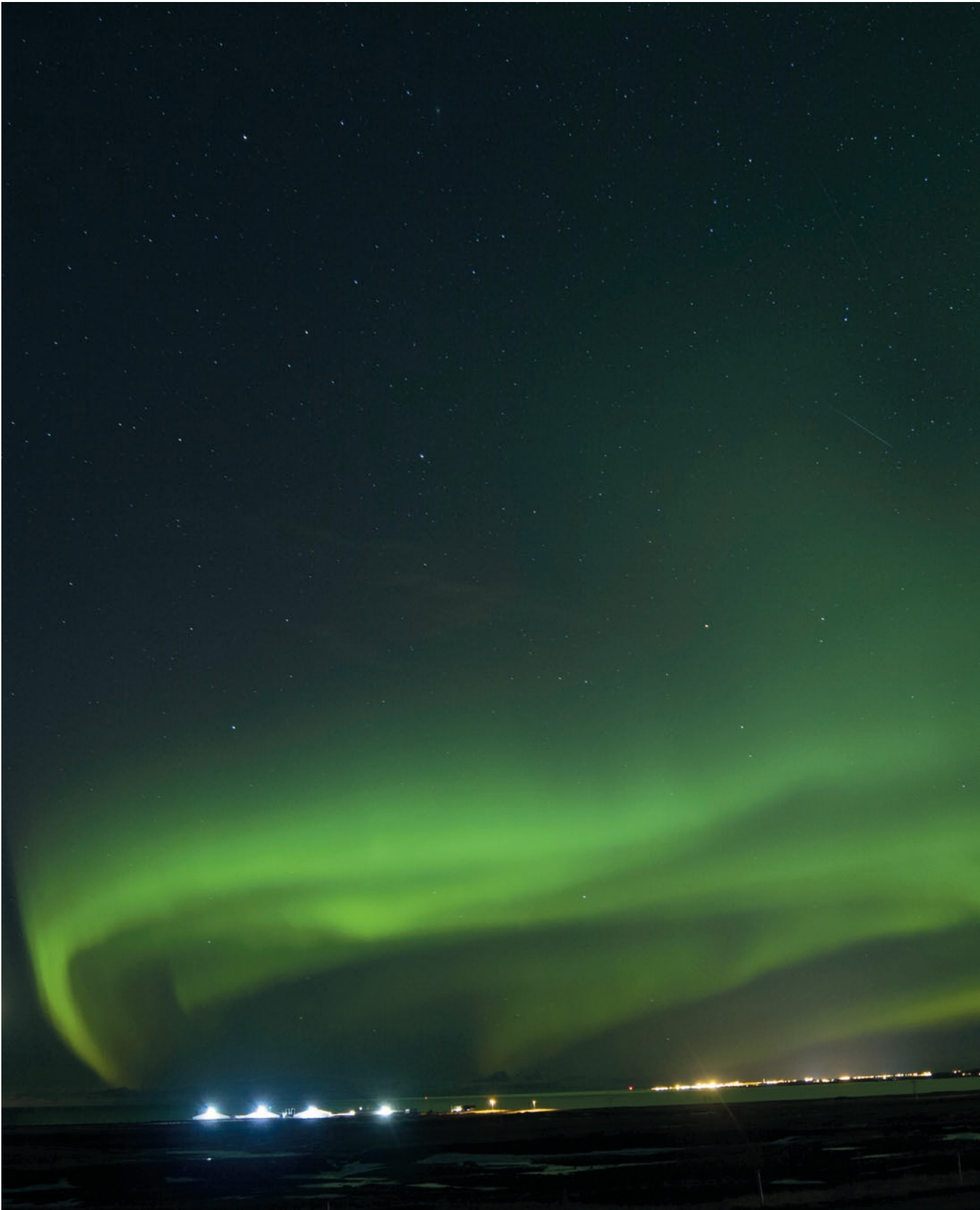
Night 2. Outside Reykjavik with light pollution from the highway