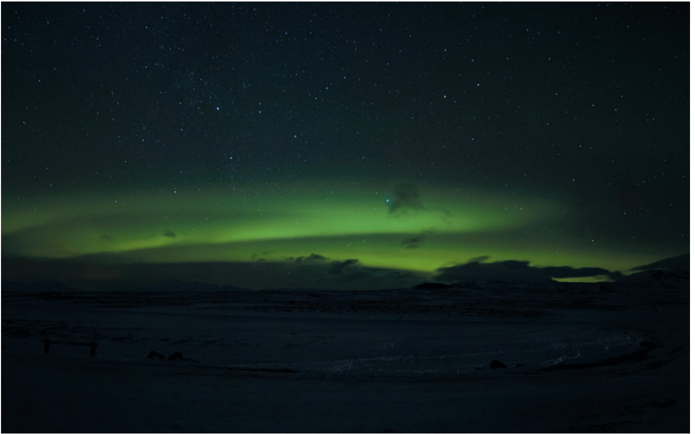
Night 1. Thingvellir National Park