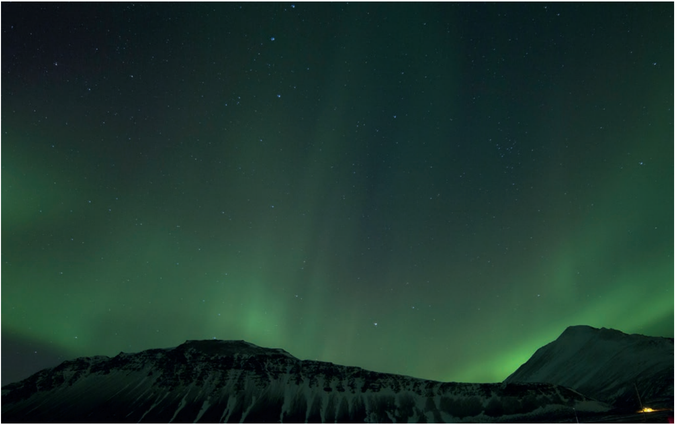
Night 2. Away from the city I

Alongside the local weather forecast, there is a nightly forecast for expected Aurora activity. The Aurora forecast is based on the Kp-index, which describes the strength of variations in the magnetic field of Earth ranging from zero (minimum activity) to nine (maximum activity). By averaging the maximum variation in the magnetic field strength over three hours, forecasters can make a fairly accurate prediction for the strength of northern lights activity. Most days the Kp-index is between 0-3 (no activity to moderate activity); the highest numbers are quite rare ( http://en.vedur.is/weather/articles/nr/2549 ).