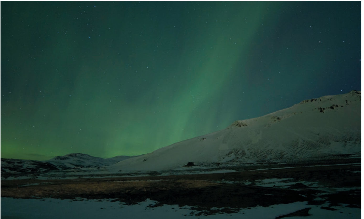
Night 2. Outside Reykjavik

after taking a few long exposures and then viewing them on our cameras' displays, we could see what it is that makes people come so far to get a glimpse of the northern lights. The lack of light pollution in the area made it an excellent place to take pictures of stars as well, although that was not our primary goal. The first tour had a mixed group of people, most of whom were primarily interested in the spa and were not serious photographers. From their disappointed chatter I could tell that many of them expected bright, colorful lights that they could snap pictures of with their iPhones. Several people tried and failed to get images, and we helped as much as we could (the bus driver even offered to help people with their camera settings). Eventually, after we had taken a satisfactory number of pictures, we got back onto the bus with everyone else to escape the cold and wind.