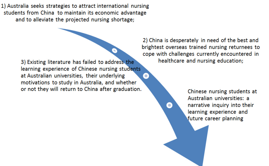
What are the learning experiences of Chinese nursing students at Australian universities?

Social conditions include the context of administration, policy, and community.<sup>[11]</sup> Continuity refers to the temporal conditions in which people and events are situated.<sup>[11]</sup> In this sense, the six Chinese nursing students' past experience, present actions, and future plans all inform and relate to their learning experience and cannot be discussed independent of time. Place refers to the situation in which an event happens. Narrative inquiry is bound by place.<sup>[11]</sup>