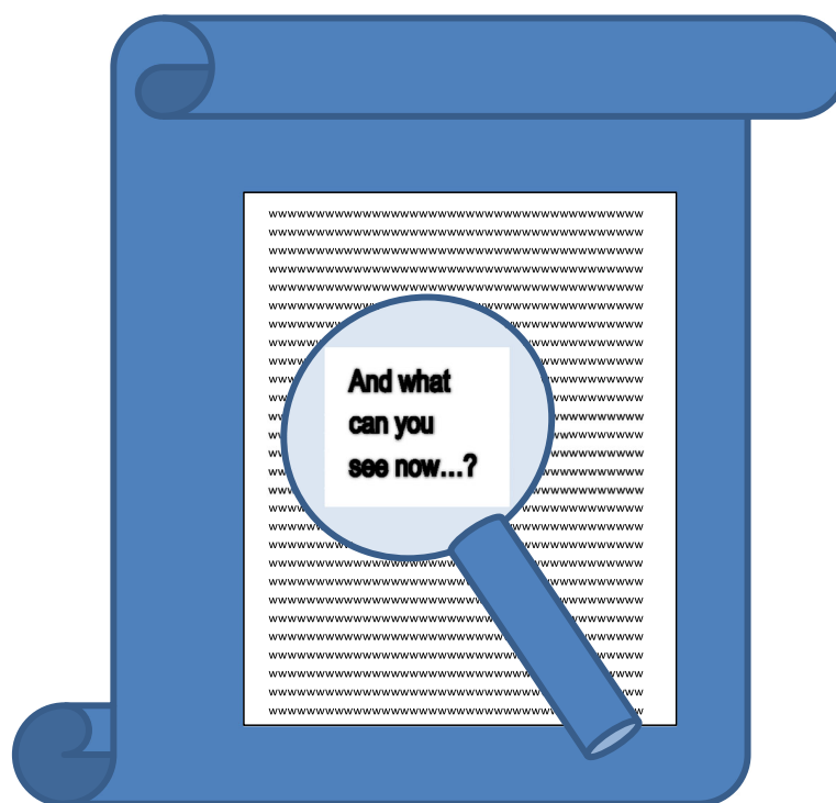
Fig. 1 “Precision” itself does not guarantee for better understanding of an issue. An old wise dictum adopted by all European cultures/languages warns— one cannot see the forest for the trees . Hence, technologically driven higher resolution of individual elements does not automatically mean that you can better recognise the complex problem which you are looking for, particularly when the zoomed element (the tree) is prioritised and/or pulled out from the overall context or zooming itself makes the complete picture (the forest/multifactorial issue) unreadable. Contextually, better understanding of the complexity in medicine is not guaranteed by “precision medicine” itself. Advanced health care demands a close cooperation between all issue-related fields, integration of multidisciplinary knowledge and innovative technologies based on long-term strategies and concepts considering interests of patients, professionals and society at large

Global deficits are well-defined and described elsewhere as unpredictable, unpreventable and impersonal medicine [20, 21]. It is evident that a paradigm shift is needed to move from “reactive” to “predictive, preventive and personalised medicine” as a new philosophy